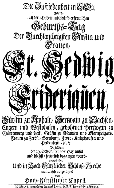
Figure 1: 'Die Zufriedenheit in Gott', libretto to Praise the Lord O my soul by J. F. Fasch, Zerbst, Franciscum Library: A. 11. m., fol. 39, no. 5