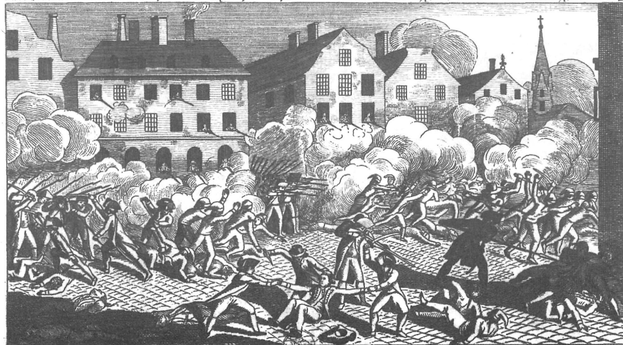
Le 2 Décembre 1792. Francfort a été repris par les Prussiens, d'après une trahison insigne. Environ douze cent Français ont été égorgés dans les Rues et places, par dix mille assaillans armés de bayonettes et de sabres.