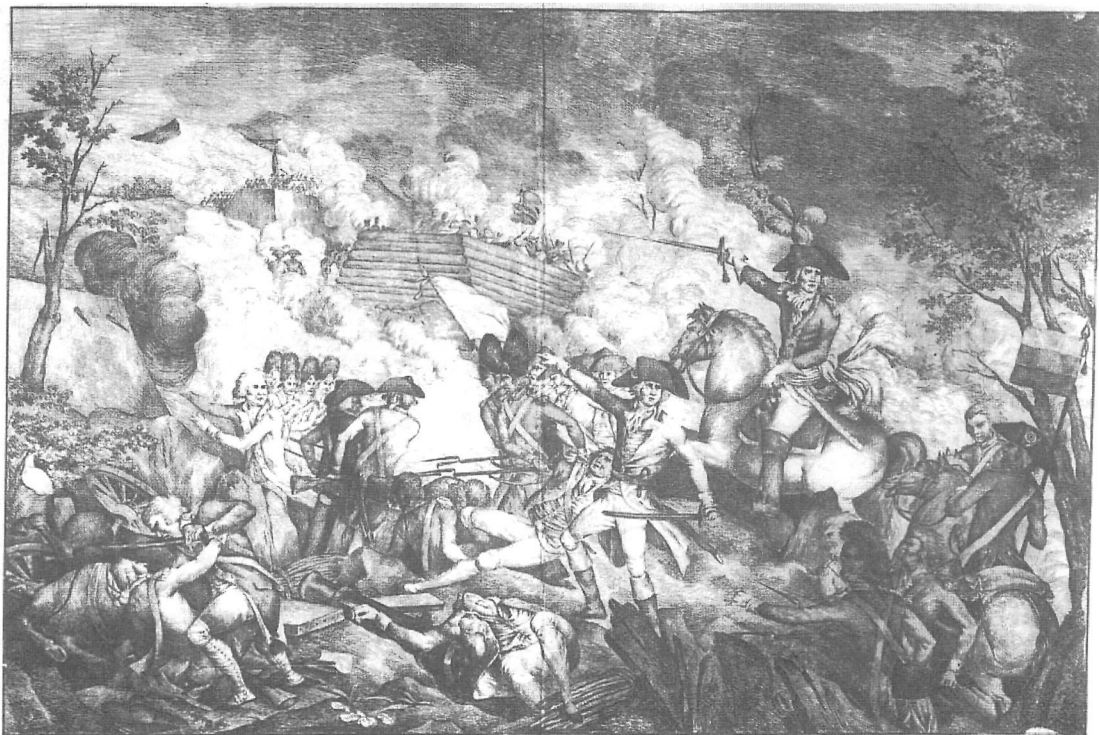
BATAILLE DE GEMMAPE livrée et gagnée par les François sur les Autrichiens le 6 Novembre 1792.

L'armée des Autrichiens dont l'effectif étoit de 35,000 hommes et la nôtre de 30,000, sans compter les volontaires, étoit placée sur une colline, au-dessous de laquelle se trouvoient les débris de la citadelle. Les Autrichiens occupèrent le point de vue, et les François, en s'élevant sur un promontoire, se dirigèrent vers la citadelle. Les Autrichiens, voyant que les François étoient maîtres de la colline, se retirèrent vers la citadelle. Les François, voyant que les Autrichiens se retiroient, se dirigèrent vers la citadelle. Les Autrichiens, voyant que les François étoient maîtres de la colline, se retirèrent vers la citadelle. Les François, voyant que les Autrichiens se retiroient, se dirigèrent vers la citadelle.