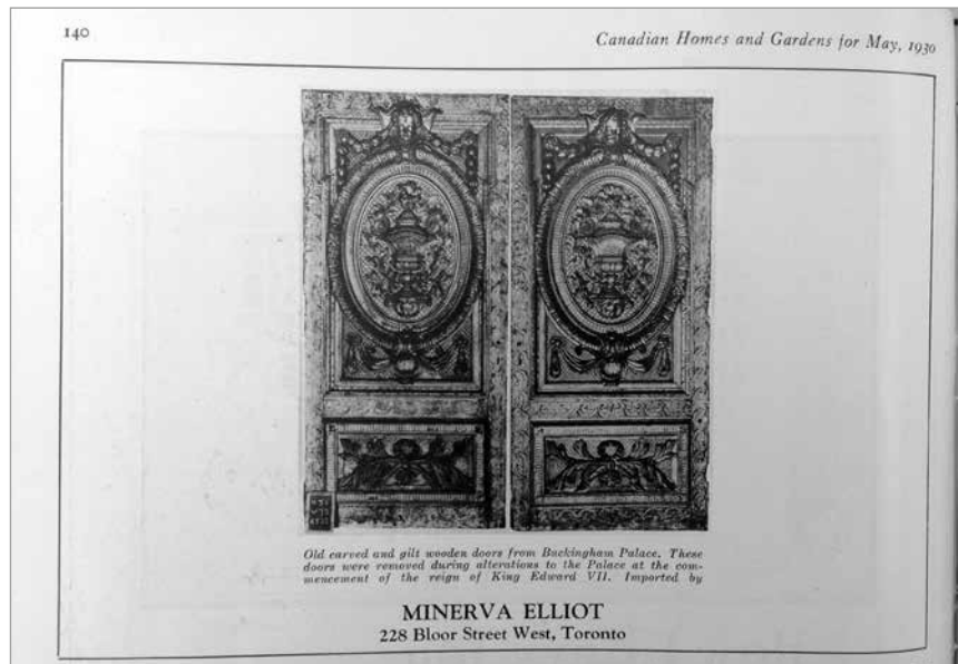
FIG. 4. ADVERTISEMENT FEATURING A PHOTOGRAPH OF GILT WOODEN DOORS FROM BUCKINGHAM PALACE. | CANADIAN HOMES AND GARDENS, MAY 1930, P. 140.

light and equipment, elaborate plumbing, and the accessories of rapid communication, such as motor cars, telephones and radios, have exercised new influences in the handling of a home, and changed, as well, people's lives and habits. There is a scarcity of domestic help; therefore, houses are planned, decorated and equipped with the view to keeping labor to the minimum. 33