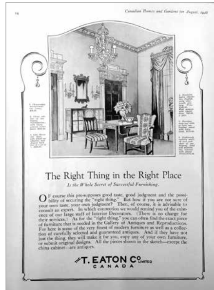
FIG. 6. ADVERTISEMENT FOR THE T. EATON COMPANY'S GALLERY OF ANTIQUES AND REPRODUCTIONS AND STAFF OF INTERIOR DECORATORS. | CANADIAN HOMES AND GARDENS , AUGUST 1926, P. 14.

This allowed CHG to appease the varying tastes of their modern readers. In the form of editorials and advertisements, CHG communicated the idea of modernity, or at least created a medium for discussions—and debates—about it.