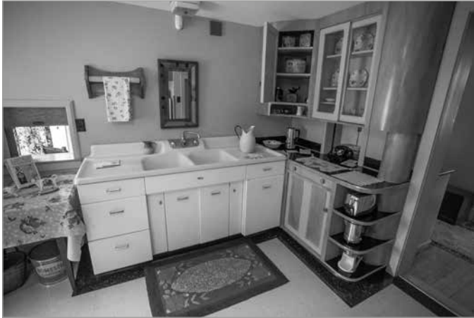
FIG. 12. A CORNER OF THE KITCHEN IN THE WYATT HISTORIC HOUSE MUSEUM, FEATURING THEIR KITCHEN QUEEN SINK. | ADAM KIRKEY, 2014.