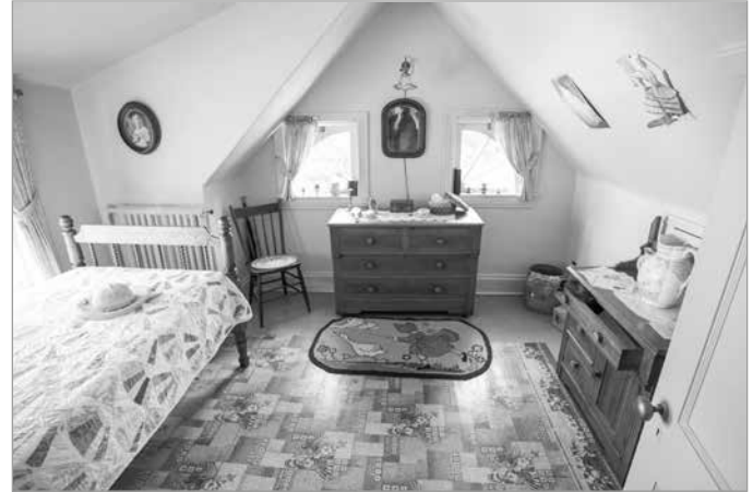
FIG. 13. THE "HIRED GIRL'S ROOM" IN THE WYATT HISTORIC HOUSE MUSEUM.