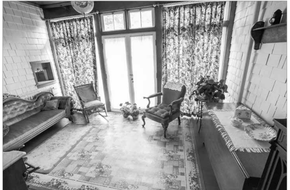
FIG. 14. THE SUN PARLOUR IN THE WYATT HISTORIC HOUSE MUSEUM.