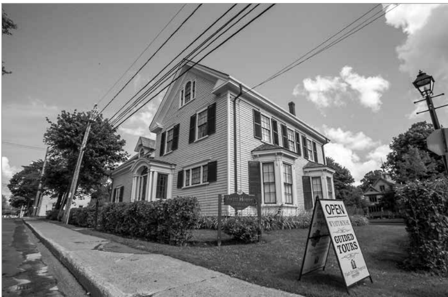
FIG. 1. THE WYATT HISTORIC HOUSE MUSEUM OR "WYATT HOUSE," LOCATED AT 85 SPRING STREET IN SUMMERSIDE, PRINCE EDWARD ISLAND. | ADAM KIRKEY, 2014.

This essay argues that historic house museums can be reconceptualized to serve as effective sites of narration for important and seldom acknowledged women's histories. Despite the nineteenth and early-twentieth centuries correlation between women and domestic spaces, many Canadian house museums were created to preserve the histories of prominent male figures from our past. I argue that the Wyatt Historic House Museum operates outside of that model and is a unique example of a house museum that highlights diverse women's