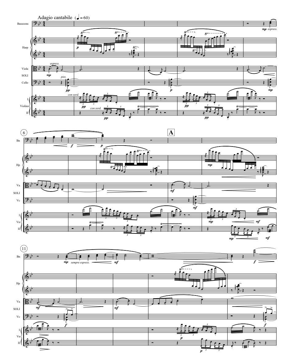
Example 1. Forsyth, Double Concerto, ii: mm. 1–27. Reproduced by permission of Counterpoint Music Library Services.