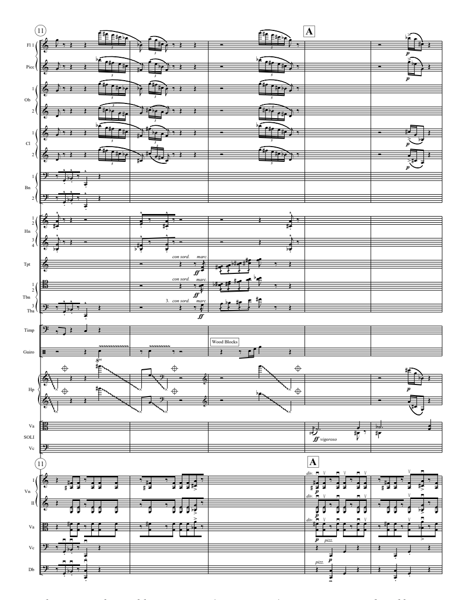
Example 10. Forsyth, Double Concerto, i (2008 version): mm. 11–15. Reproduced by permission of Counterpoint Music Library Services.