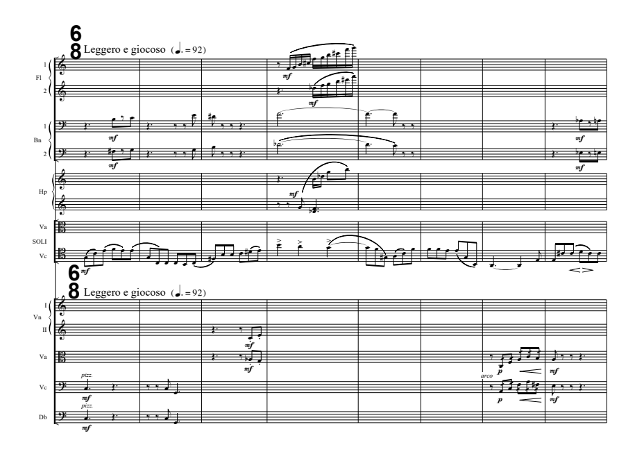
Example 11. Forsyth, Double Concerto, iii (2004 version): mm. 1–8. Reproduced by permission of Counterpoint Music Library Services.