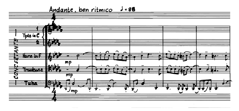
Example 15. Forsyth, Sagittarius: Concerto Grosso No. 1, Andante, ben ritmico: mm. 1–5. Score excerpt in the composer's own hand.

sixths. Few university-employed composers dared write music so harmonious and melodious at the height of North American academic modernism.<sup>36</sup>