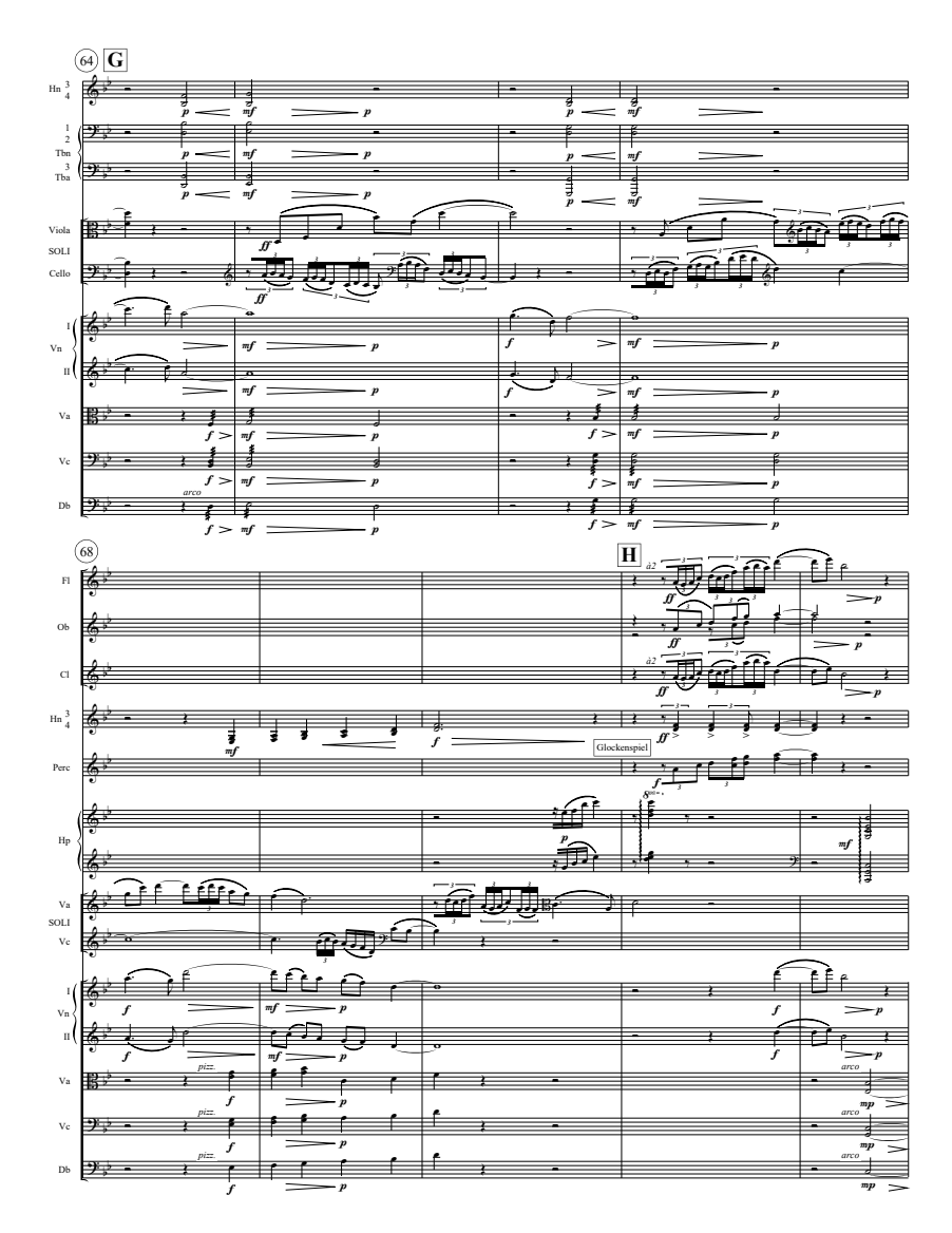
Example 2. Forsyth, Double Concerto, ii: mm. 64–72. Reproduced by permission of Counterpoint Music Library Services.