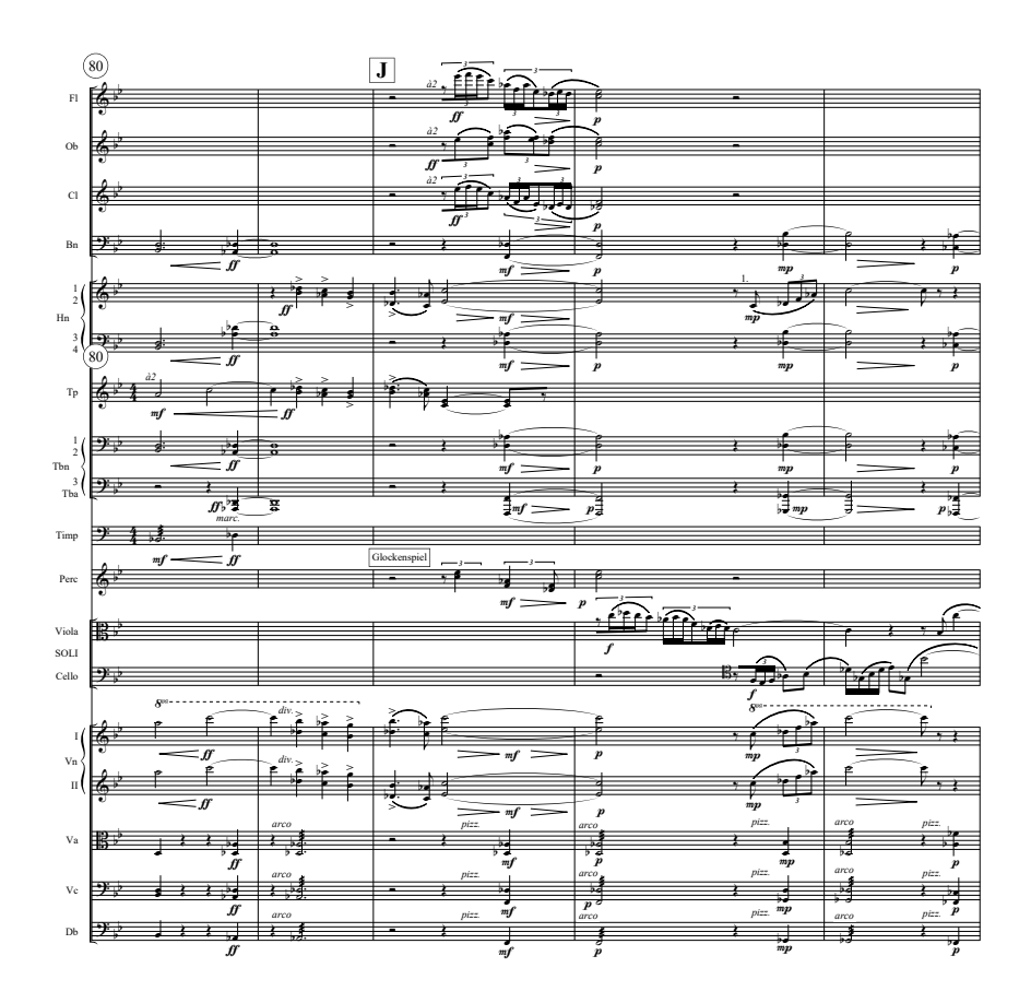
Example 3. Forsyth, Double Concerto, ii: mm. 80–95. Reproduced by permission of Counterpoint Music Library Services.