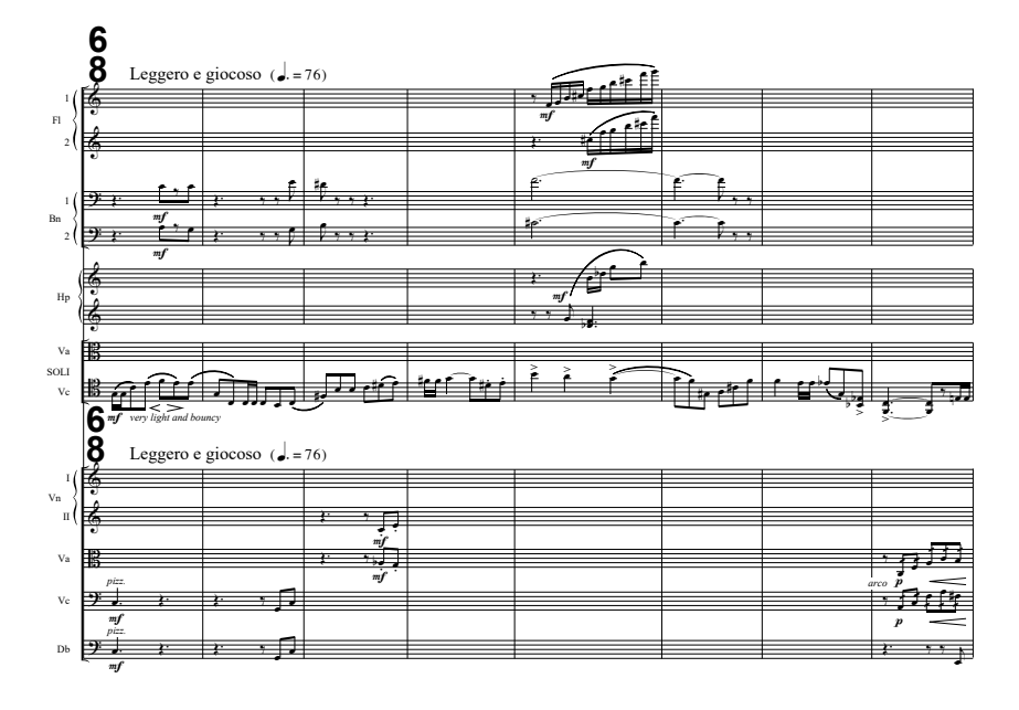
Example 12. Forsyth, Double Concerto, iii (2008 version): mm. 1–8. Reproduced by permission of Counterpoint Music Library Services.