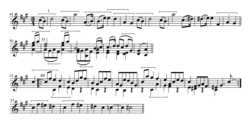
Example 8. Brahms, Intermezzo in A major, Op. 118, No. 2: a) mm. 1–8; b) mm. 35–38; c) mm. 49–60.