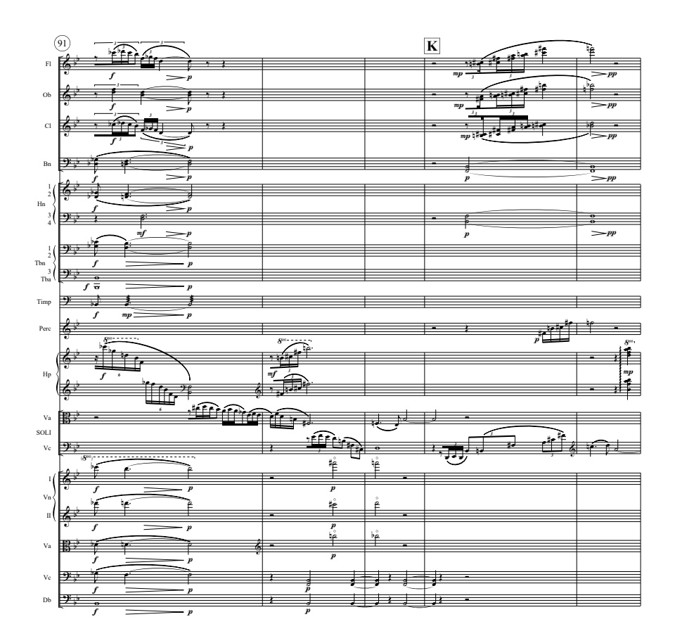
Example 3. (continued)