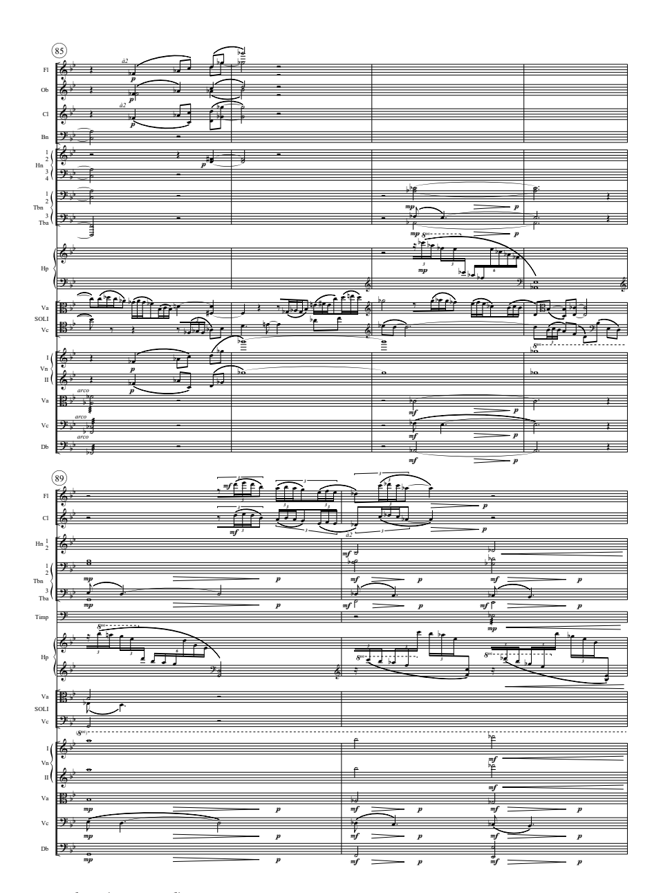
Example 3. (continued)