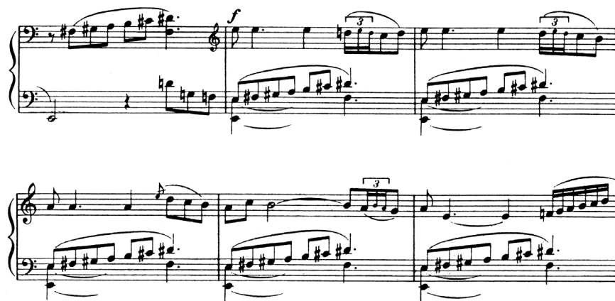
Example 4. Mode mixture as employed by Bela Bartók, Six Dances in Bulgarian Rhythm , no. 1, mm. 3–8, from Mikrokosmos , vol. 6. Dance in Bulgarian Rhythm no. 1 from Mikrokosmos by Béla Bartók. © Copyright 1940, 1987 by Hawkes & Son (London). Reprinted by permission.

All in all, clashes occur frequently in this mazurka on scale degrees 3, 4, 6, and 7. Analysis of clashes by scale degree will be taken up in the last section.