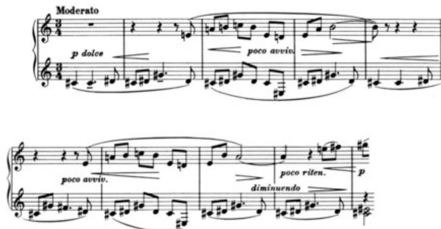
Example 6. A candidate for bitonal analysis: Mazurka op. 50, no. 3, mm. 1–10. Karol Szymanowski “Mazurkas | für Klavier | op. 50”. © Copyright 1926 by Universal Edition A.G., Wien. www.universaledition.com