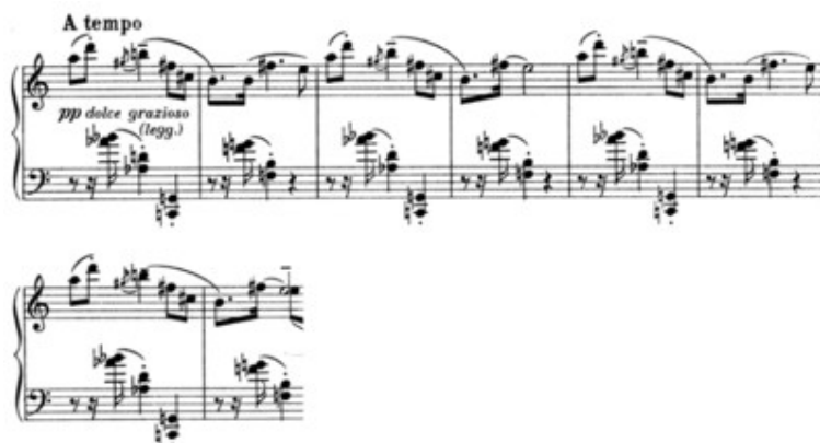
Example 2. Dissonant structure superimposing many layers, in Szymanowski, Mazurka op. 50, no. 19, mm. 13–20. Karol Szymanowski “Mazurkas | für Klavier | op. 50”. © Copyright 1926 by Universal Edition A.G., Wien. www.universaledition.com

The striking feature of this passage is the extent of harmonic disagreement among its component parts. These include the bagpipe fifth on C, 11 some broken dominant sevenths alternating between B b and G (suggesting octatonicism), and a melody (suggesting pentatonicism) that is probably centred on B—or is it on E? With so many conflicting tonal influences and modal collections, and with only conflicting harmonic support, it is rather difficult to tell. How, then, is one to categorize the whole combination? It isn't clearly bitonal, it isn't really "polytonal" (i.e. built of more than two pitch centres), it isn't whole-tone, octatonic, or pentatonic, yet it certainly isn't atonal, with so many elements evidently taken from the tonal and modal vocabulary. 12 The issues of modality and key centre need to be addressed.