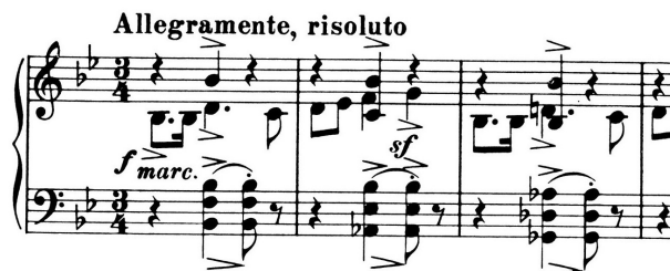
Example 1a. Free parallel fifths from the Mazurka op. 50, no. 4, mm. 1–3. Karol Szymanowski “Mazurkas | für Klavier | op. 50”. © Copyright 1926 by Universal Edition A.G., Wien. www.universaledition.com