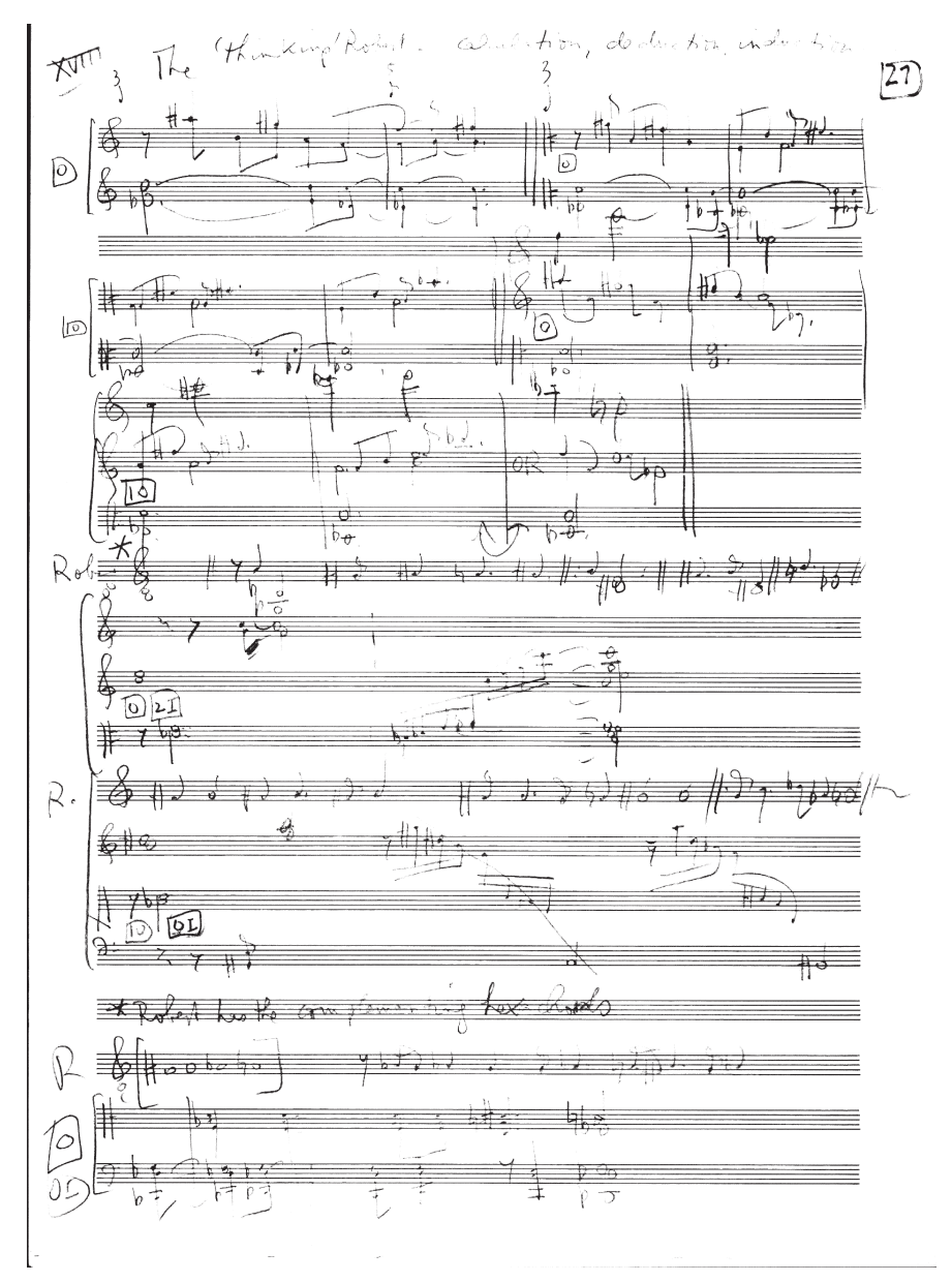
Example 1. Row XVIII ("the thinking Robert") from Anhalt's Oppenheimer sketches (file D1.91, box 60, MUS 164, Libraries and Archives Canada)