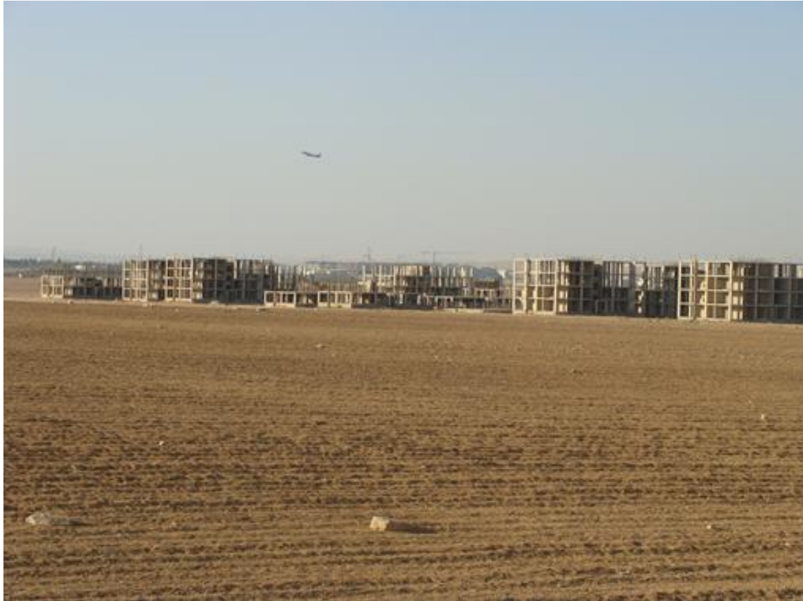
Fig. 3 - The low-income housing project at al Jizza. The building of the newly construction international airport are in the background.

that the researchers' six criteria are indeed significant underlying factors for enhancing social sustainability of local urban development projects.