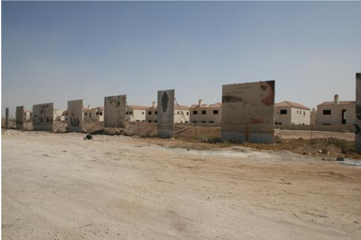
Fig. 2 - The gated community site of Andalusia on the Airport Highway.

According to Chan and Lee (2008) (quoted in Mac & Peacock, 2011, p. 4–5), in order for urban developments to be socially sustainable, they must create a harmonious living environment, reduce social inequality and divides, and improve quality of life in general. Moreover, they identify six criteria for evaluating whether social sustainability has been achieved: provision of social infrastructure, accessibility, availability of jobs, possibility to meet psychological needs, townscape design, and preservation of local characteristics. In their study, the researchers conducted a questionnaire survey in Hong Kong through which they collected and evaluated the opinions of architects, planners, property development managers and local citizens. The responses confirmed