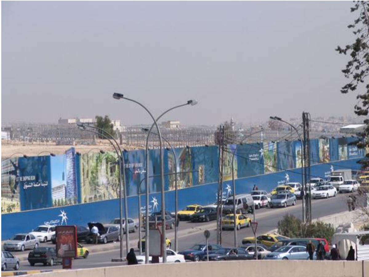
Fig. 1 - A stretch of billboards around the Abdali site during its early stages of construction some 4 years ago.

a non-existent concept in the city until the 2000s, six malls have opened up in Damascus between 2001 and 2009 and 14 others have been announced.