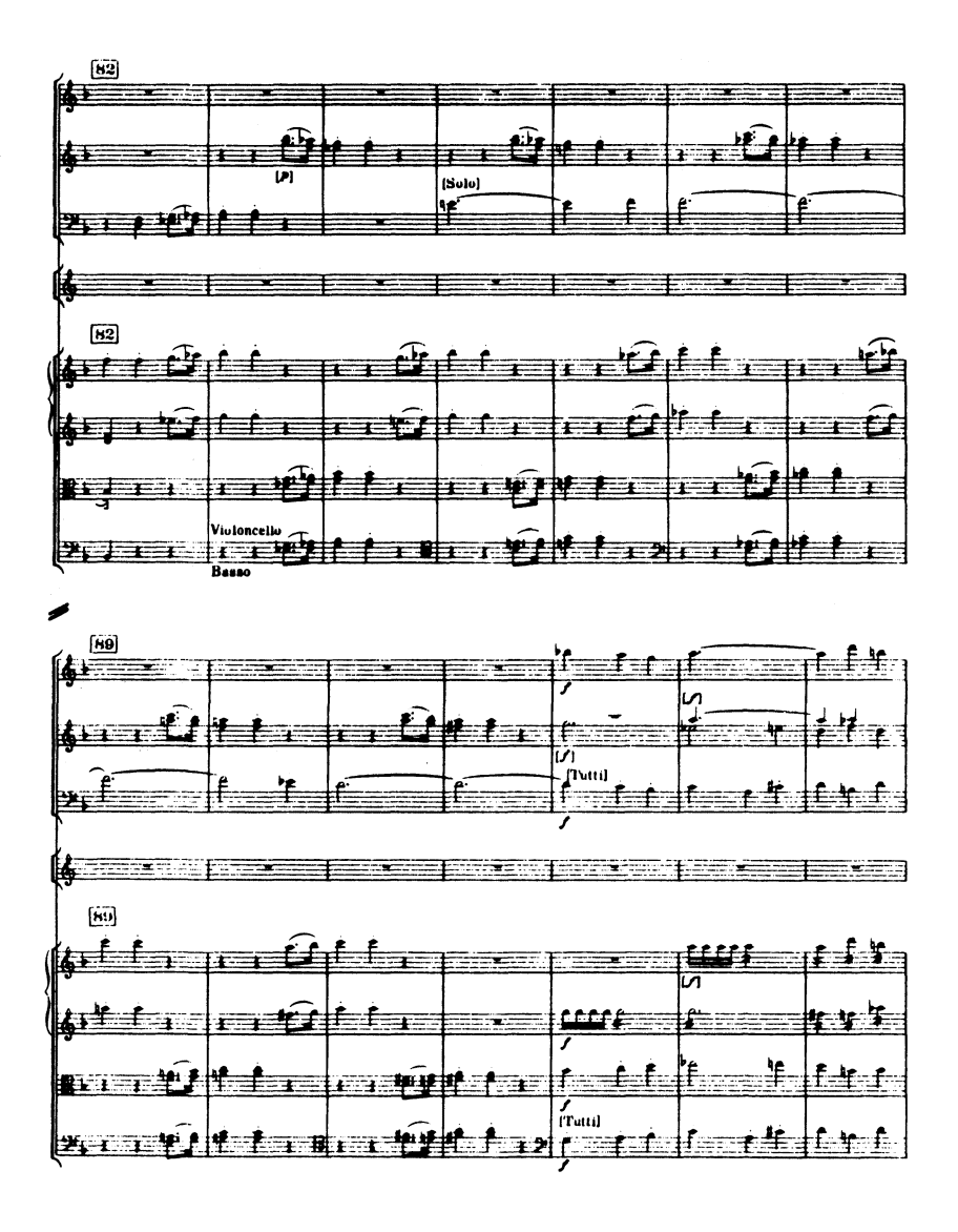
Figure 6. : Haydn, Symphony No. 80 in d, I, mm. 28-95.