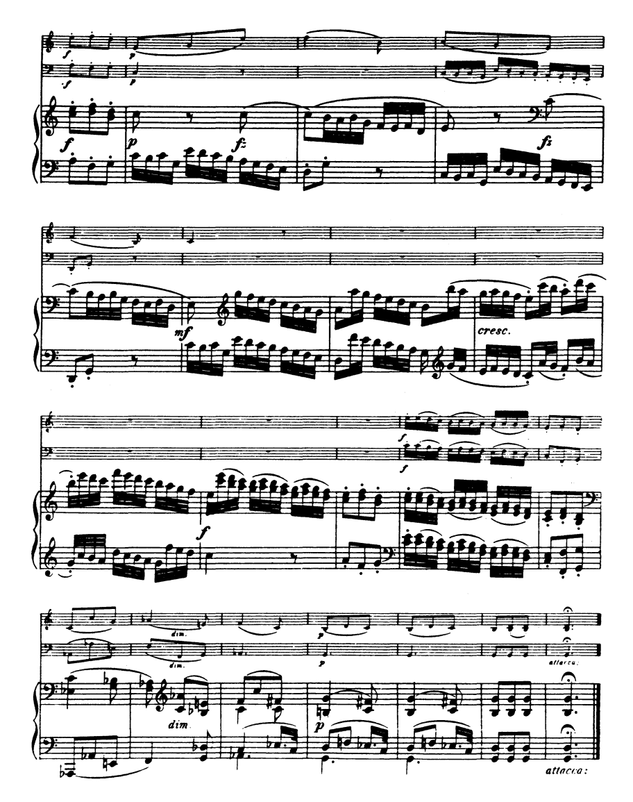
Figure 8. : Haydn, Piano Trio Hob. XV:20, II, mm. 95-114.