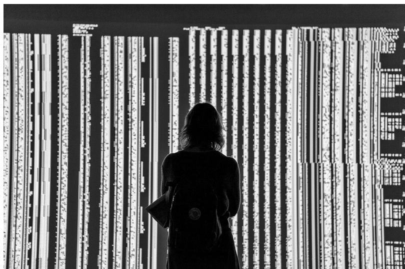
FIGURE 2 Ryoji Ikeda, data.tron [3K version] , 2014.

To live in the texture of numbers as flesh rather than as calculations I need to listen to the works' sound whose data operations reveal the indeterminacy and arbitrary nature of the human body as the agent of its construction. Through the notion of composition the work admits to the mind dependency of their