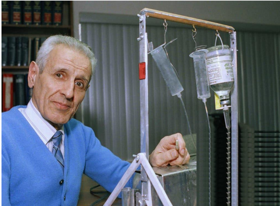
Figure 1: Dr. Jack Kevorkian showed reporters his "suicide machine"

This was the fifth time in a decade that prosecutors had tried Dr. Kevorkian in the death of a seriously ill person. Three trials ended in acquittal and a fourth ended in a mistrial. In all the previous cases, Dr. Kevorkian had violated laws against assisted suicide by helping patients give themselves a fatal injection through a so-called suicide machine (Figure 1)