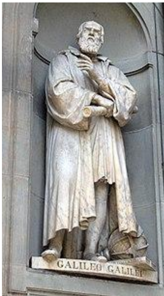
Figure 3: Statue outside the Uffizi, Florence