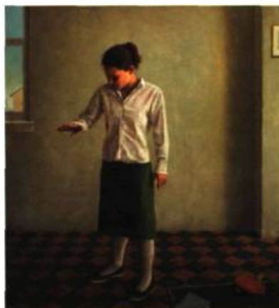
Interior with Girl and Ping Pong Table

September 28 – October 9 Galerie de Bellefeuille 1367 avenue Greene Tel.: 514 933-4406 www.galeriedebellefeuille.com