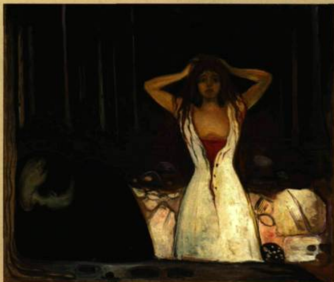
Ashes , 1894 Oil on canvas 47 7/16 x 55 1/2" (120.5 x 141 cm) The National Museum of Art, Architecture, and Design/National Gallery, Oslo.

Born at Løten in Hedmark, Norway December 12, 1863 Munch encountered much sickness in the family, and death. When the family moved to Grünerløkka a Kristiania suburb, after his mother died, his Aunt Karen taught Munch to draw, and to cut silhouettes out of paper and make landscapes out of moss and straw. It is Munch's incredible sensitivity to the world and life in general that makes his art a true success. He expressed his life's experience with a simplicity and a sincerity, colouring it all intensely. Even his Self Portraits which recur throughout this exhibition are endearing for their penetrating gaze on the artist's life. We see an early realist portrait from 1886 where the artist has an intense gaze, a powerful lithograph Self Portrait (with Skeleton Arm) from 1896, Self Portrait with Cigarette (1895) which has