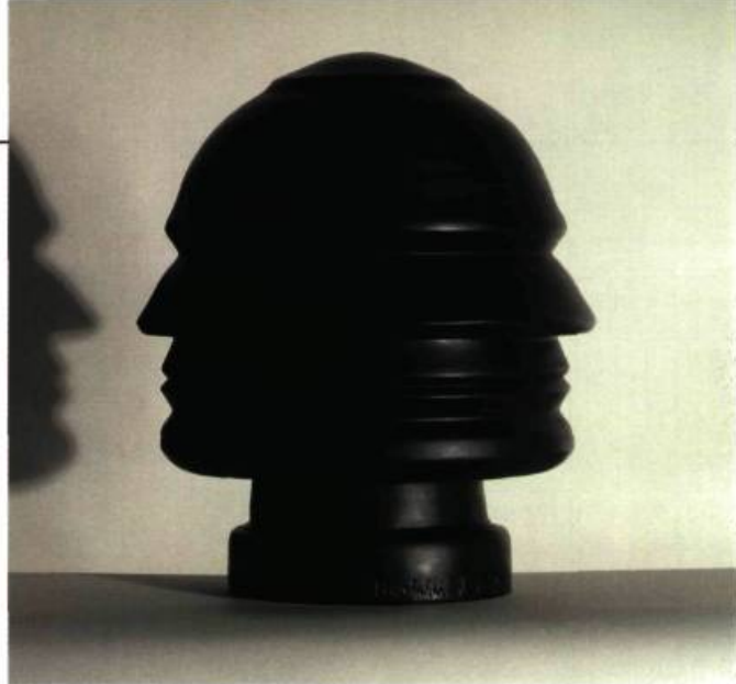
Renato Bertelli Lastra a Signa, Firenze, 1900 - Lastra a Signa 1971 Testa di Mussolini (Profilo continuo) [Head of Mussolini (Continuous Profile)], 1933 Patinated terracotta H. 34 cm; D. 27 cm Mark - Museo d'Arte Moderna e Contemporanea di Trento e Rovereto

Il Modo Italiano is an ambitious and compelling overview of the currents of Italian art and design through the 20th century, segmented into aesthetic eras: Boundless Optimism , Violence and Speed , Monumentality and Rationalism , among others that, delineate distinct segments of time and their cultural production. Each era is accompanied by a lengthy wall didactic taking into account the political and economic cauldron in which it brewed. Boundless Optimism starts the exhibition off with the Art-Nouveau-influenced Stile Florale works that reflect the comparatively late accumulation of industrial wealth