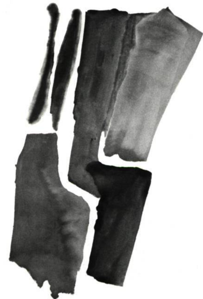
helen frankenthaler (1928 - ) yellow-south west , 1969. acrylique sur toile; 96 po. sur 48 (243,9 x 123,85 cm.).

new-york, andré emmerich gallery.