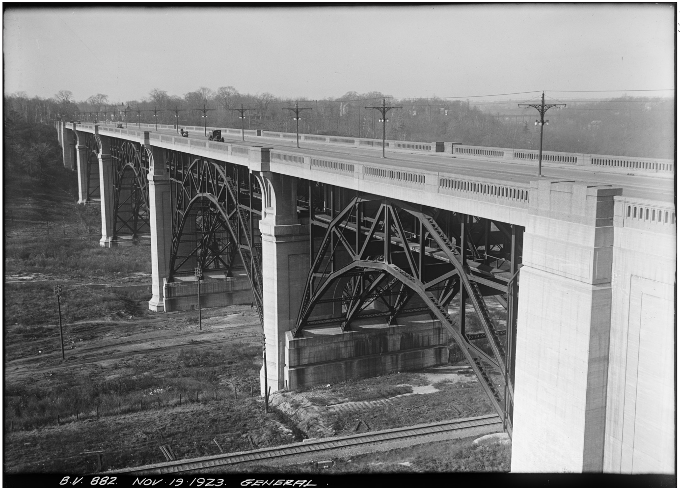
Bloor Viaduct, Don Section, 19 November 1923, item 882, subseries 10, series 372, fonds 200, City of Toronto Archives.