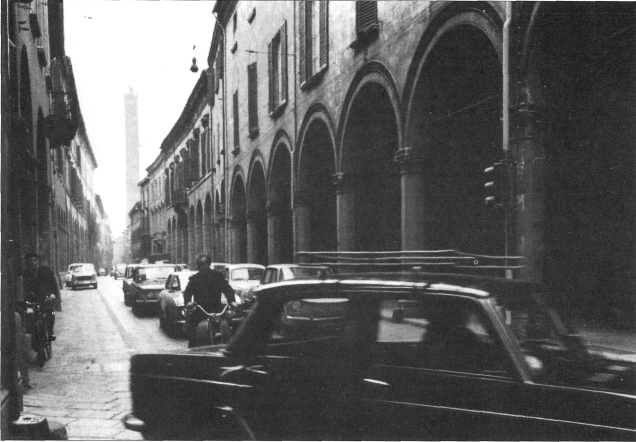
Figure 4: Paolo Monti, photograph of Strada Maggiore with traffic. From Bologna centro storico , 193.

such as pictorial traditions, literary descriptions of the city, local histories, urban biographies. 46 The complexity of this visual and textual stratification is particularly evident in the short films that Renzo Renzi made in the 1950s for the Provincial Tourist Office. His Guida per camminare all'ombra ("A Guide to Walking in the Shade," 1955), written with Leone Pancaldi, reconstructed the history of Bologna's arcades and portrayed them as the key element of the image of the city. Arcades contributed to the character of an urban scenery that was, as the script went, "perhaps without big architectural individualities but bound together and homogeneous." 47 Bologna's arcades were also a key element of Monti's photographic survey and a recurring theme of the image of the city outlined by the 1970 exhibition. It is interesting to note, however, that no specific attention had been given to these defining elements of the cityscape in the plan of 1969.