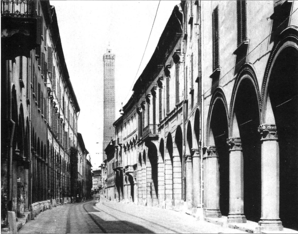
Figure 3: Paolo Monti, photograph of Strada Maggiore without traffic. From Bologna centro storico , 192.

quences of shots. It was an overview of the urban space based on a multiplicity of sights rather than an analytical investigation. The campaign offered a vision of the city characterized by perspective visuals, often accentuated by the long colonnades of Bologna's famous arcades. All photographs were taken at human eye level. Isolated details sometimes punctuated the tracking shot, almost as a series of objets trouvés . Occasionally, the photographer moved from the streets into the adjacent buildings, to explore courtyards, gardens, and architectural and ornamental details.