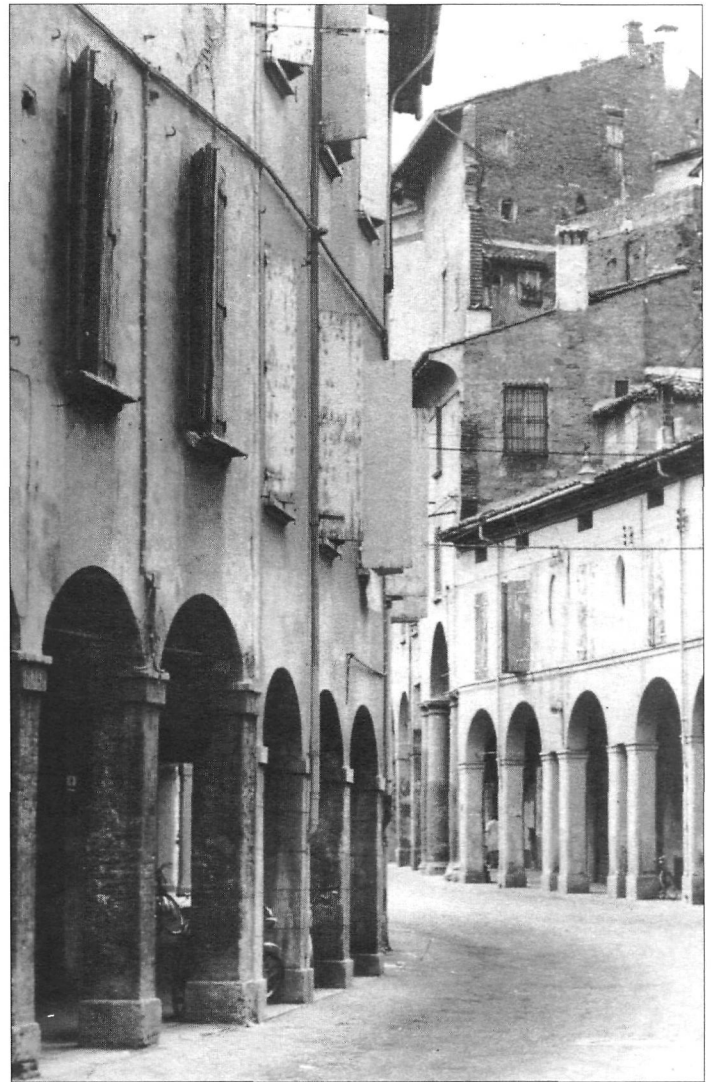
Figure 5: Paolo Monti, photograph of Via Mascarella. From Bologna centro storico , 72.

Bologna's municipal council approved the plan for the preservation of the centro storico on 21 July 1969. 31 The document was one of the varianti to the 1955 plan: it replaced the latter's