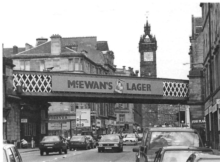
(Glasgow) The greater bargaining power of the municipalities against the railways in Britain shows on the modern landscape. Here, the elevated approach lines of the Union Railway crosses High Street, Glasgow, well clear of the road traffic. This was a speculative terminal company created in the 1860s.