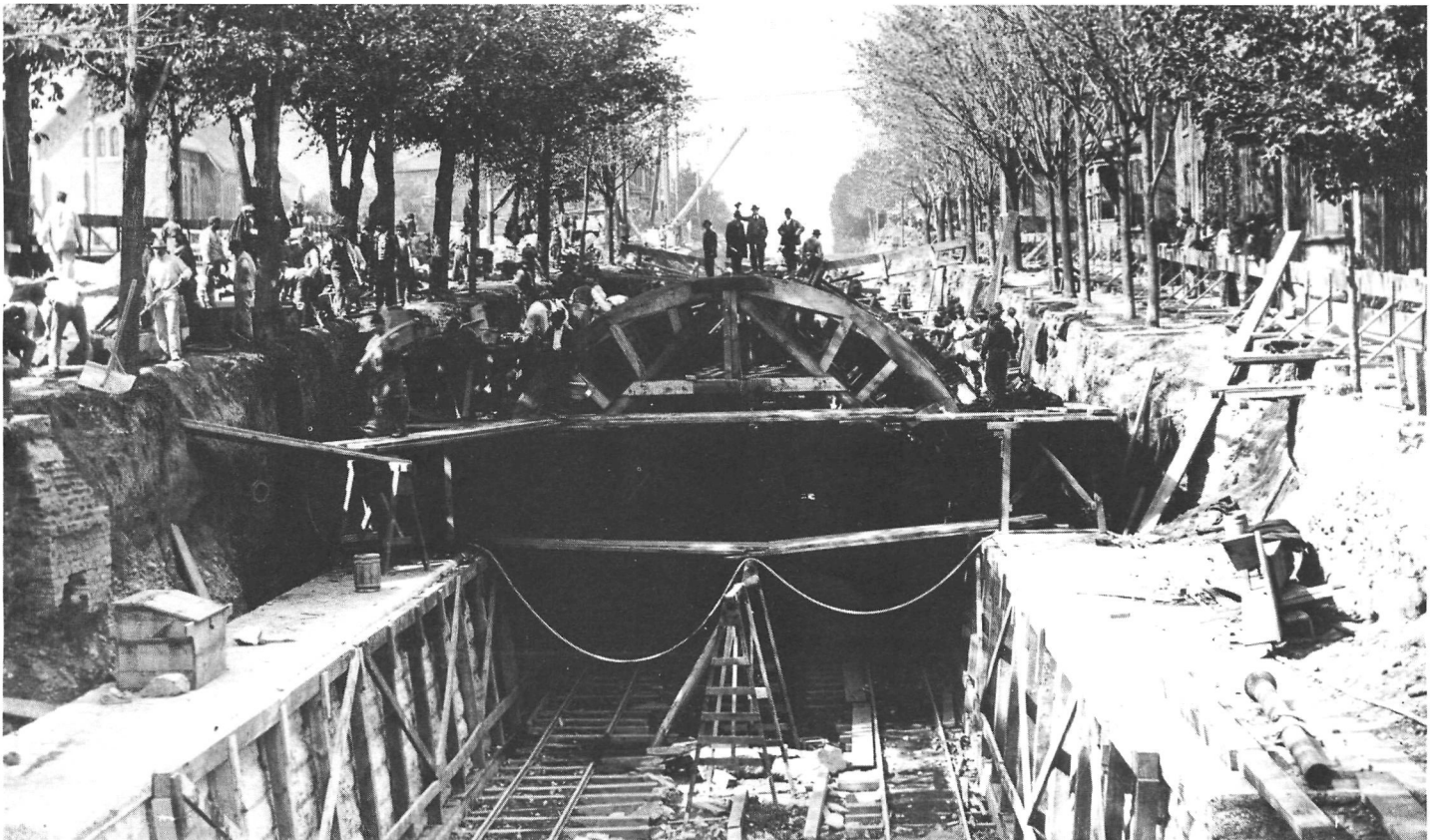
(Hamilton) Canadian railways usually crossed cities at grade level or through open cuts. The Toronto, Hamilton and Buffalo Railway built a tunnel in 1894 only where it passed through an elite neighbourhood. British cities insisted on high-standard work along railway rights-of-way.

function. In Britain the existing network of economic relationships adequately handled such accumulation and hence municipal spending was directed to the secondary function of assisting the reproduction of labour. In Canada competition among communities made this impossible. The pressure to attract capital created a much greater unity of purpose among urban elites in Canada than was possible in Britain. That unity, and the economic circumstances which created it, produced something distinctive about the Canadian city — it became a unit of entrepreneurship. It was not simply a resource for those with power to mobilize in reaction to the consequences of capital accumulation and to the movement of industry from the countryside.