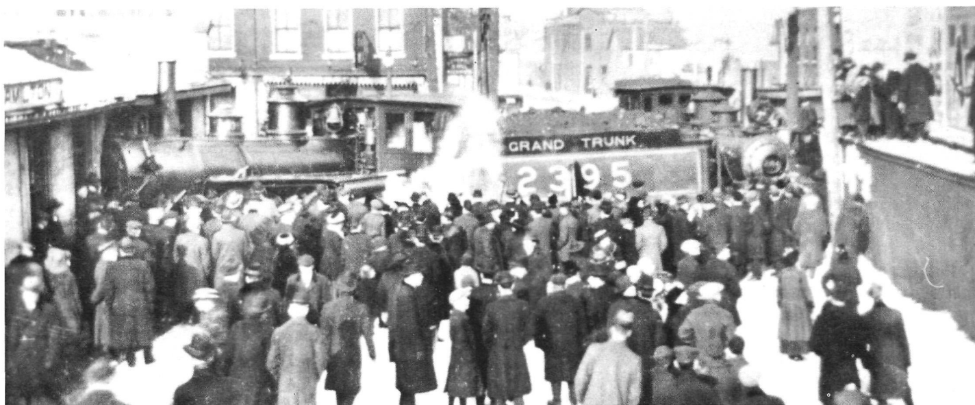
(Hamilton) Acting to facilitate economic development, Canadian municipalities granted far more to railways than British cities. Hamilton allowed tracks along Ferguson Avenue. This accident in January 1917 was exceptional, but level crossings were a widespread nuisance.