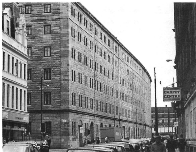
(Glasgow) Warehouse of the Glasgow and South Western Railway Company on the corner of High Street and Graeme Street, Glasgow. The site was developed by the Union Company which was able to obtain this city centre site when the university moved to suburban quarters.