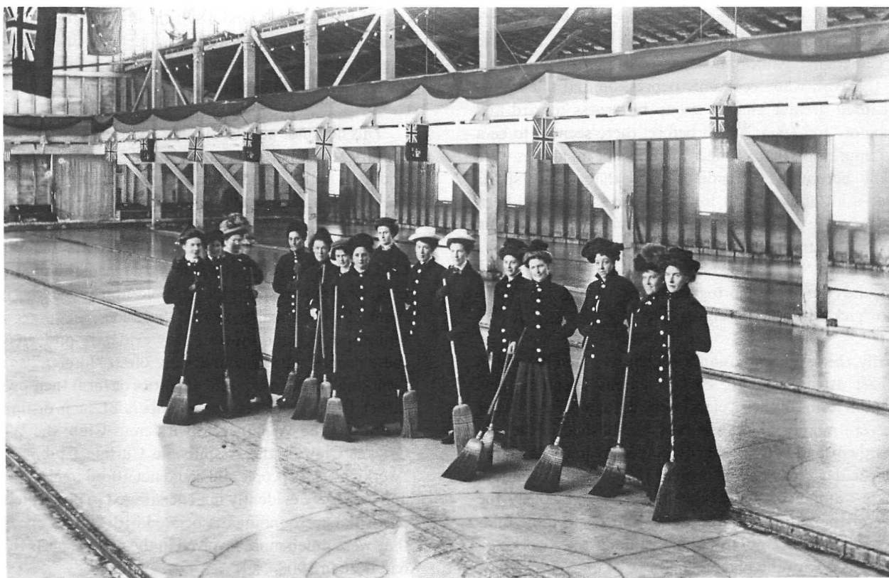
FIGURE 3. Lady curlers at the Winnipeg Board of Trade Building, c. 1906.