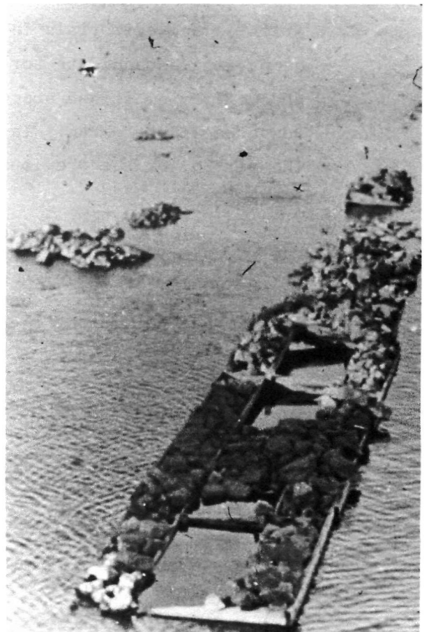
Ottawa City Water Works Pier. Location of emergency and clear water intake pipes. n.d. (Courtesy: Ottawa City Archives).