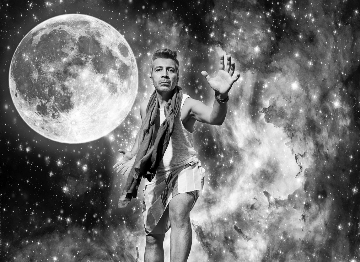
Onelight Theatre's promotional image for Asheq: Ritual Music to Cure a Lover .

we were facing, and it was suggested that Onelight find a way to create our allies” (Personal 2018). Establishing the Prismatic Arts Festival was, Sayadi and Stewart decided, one way to create their allies — that is, to help develop networks of artists, audiences, cultural workers, and sponsors in the region and across Canada committed to promoting and producing works by Indigenous and culturally diverse artists.