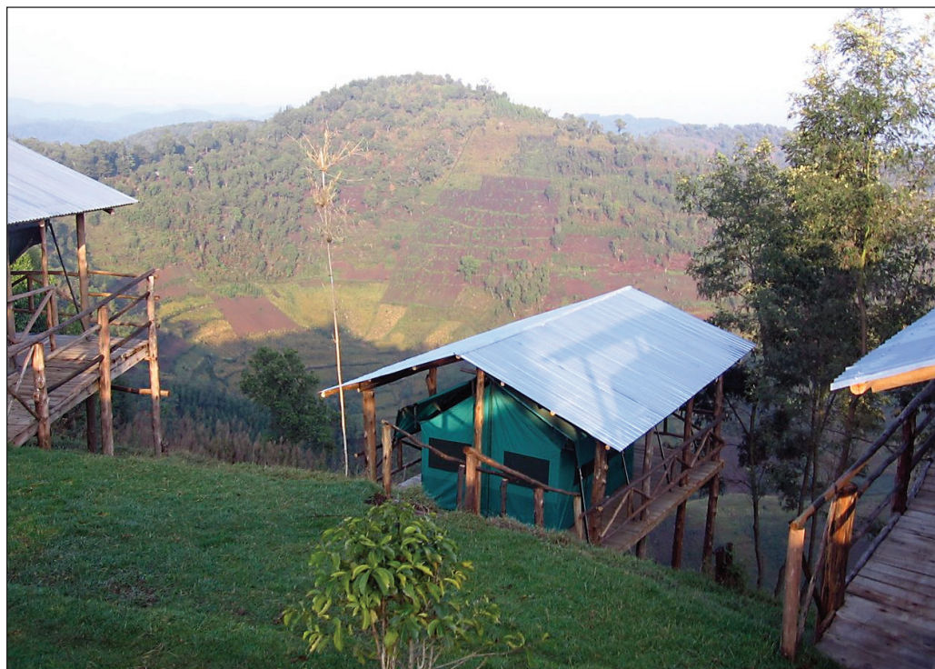
FIGURE 2 : Gorilla Friends Tented Camp, Ruhija.

interviewees used the services of a tour operator or travel agent to arrange their trip to Uganda and gorilla tracking, 15 were travelling independently.