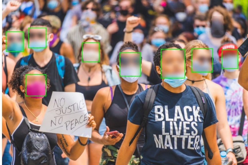
Figure 3: Edited version of “A young woman wearing a mask and Black Lives Matter t-shirt during a #BlackLivesMatter public demonstration in Cincinnati” (Garvie 2020; Wan 2020).

criminal behavior as justification of the violence enacted towards them, blackness tends to be represented as a threat and dangerous (Gray 2015: 1109). Indeed, much of the rhetoric I have discussed thus far demonstrates how surveillance reinforces the limited caricature of blackness. When images are anonymized, the affective potential for black humanity is untethered from narrow categorizations and representations of the black body as a site for violence and prosecution.