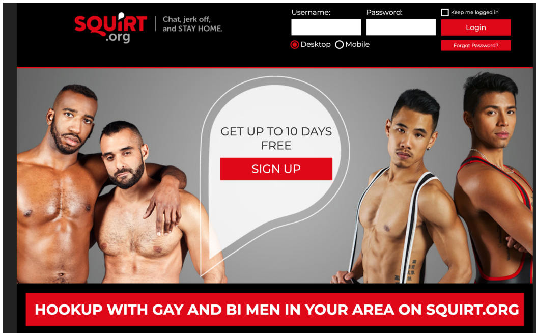
Figure 1: Squirt homepage (captured May 8, 2022).

content. Operated by queer publisher Pink Triangle Press and launched in 1999, Squirt positions itself specifically as a website to facilitate cruising, offering services such as “listing and evaluating cruising locations all over the world, providing maps and pictures of listings, as well as offering a forum for men to discuss their cruising experiences and desires in an open-minded environment” (Squirt 2022: para 3).