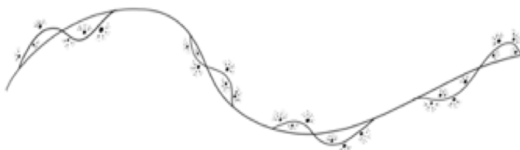
Fig.1 Curvy A.1, a Bézier curve is figuring the highest loceme, itself mapping other quasi-self-similar locemes. The lowest level locemes are black dots, which in three dimensions could figure a stylised rock, just

The fundamental symbol of Curvy A is a stylised river shape, curved, hence the name, which is essentially a Bézier curve (fig. 1). As it turns out, a more complex, asymmetric and packaged curve (that is, with more meanders) is intuitively more memorable, and allows for the mapping of more content in a single view (fig. 2). This river shape is a strand of loci (fig. 3), each being another strand for other loci (fig. 4) which are groups of noems of various shapes so as to facilitate their memorisation. The purpose of Curvy A is to capture some of the aspects of the interaction between long term and short term memory in the method of loci, and to make it writable in a procedural manner. Hence, being an externalisation of the method of loci, it is a media, albeit fundamentally different from writing. Among other things, it is a procedural writing.