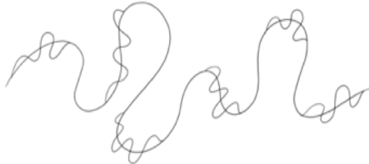
Fig.2 Curvy A.2, first step: the curve is made more complex so as to map more locemes in the same space. As a stylised river, it has more asymmetric meanders, making it slightly more memorable.

like the Bézier curves are stylised rivers. The lowest levels locemes are directly mapping noems, unlike the higher-level ones.