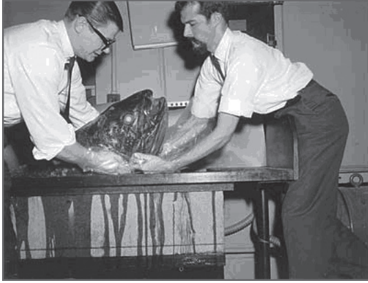
Fig. 2. Rescuing the lost forms of yesteryear: The materialist historiographer at work. "Seminars on Science: Diversity of Fishes." American Museum of Natural History. 2001. American Museum of Natural History . < http://www.amnh.org/learn/pd/fish_2/photo_gallery/coelacanth.html >

capturing of such a forgotten thing would hence represent something of a victory for Benjamin's materialist historiographer.