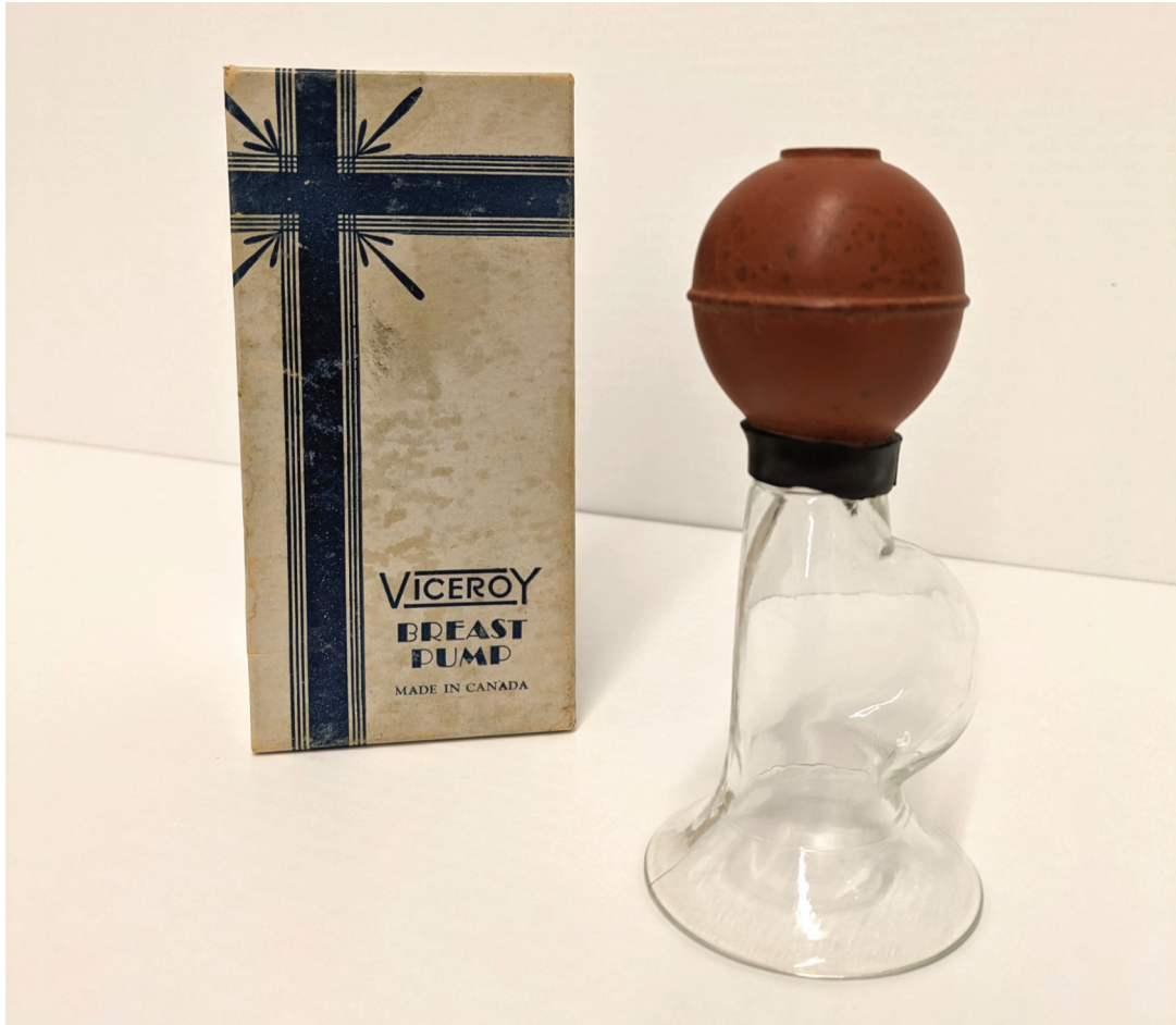
Figure 3: Viceroy Breast Pump (Ingenium artifact 1991.0253) with its box.

notable piece of information is the specification of “West Toronto” for Viceroy’s location. 39 Researching further, I found that Viceroy was indeed a Canadian Rubber Manufacturer. They are featured in the Canadian Museum of History’s online exhibition “Canada at Play” which explains that they made children’s toys. 40 I find this an interesting connection with breast/chestfeeding but I was unable to find an example of their breast pump in the catalogues available online. In our own library, I did find many medical technology catalogues with similar pumps illustrating that this was a common style.