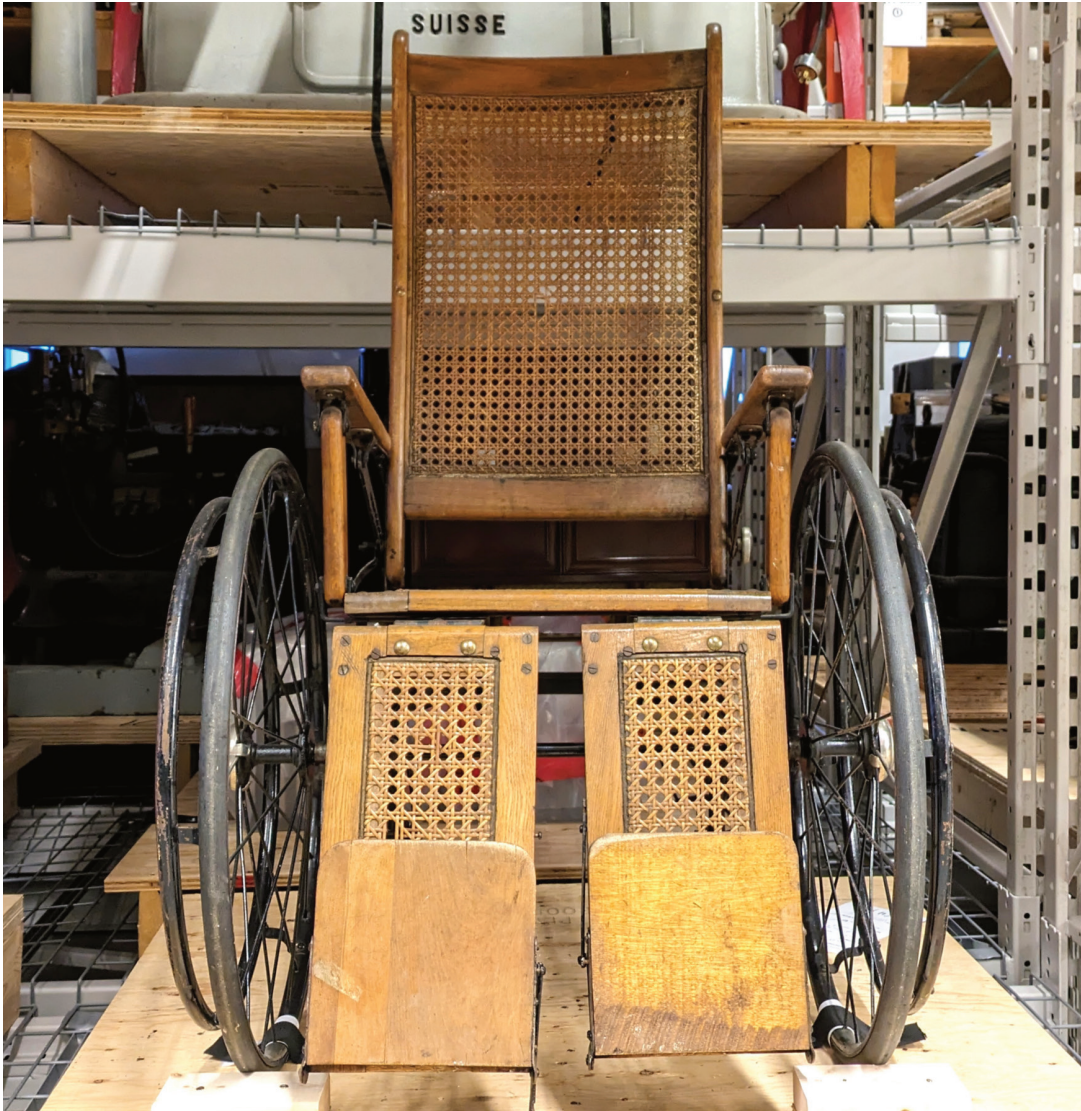
Figure 2: Gendron Wheelchair (Ingenium artifact 1991.0223) on a shelf at the Ingenium Centre.