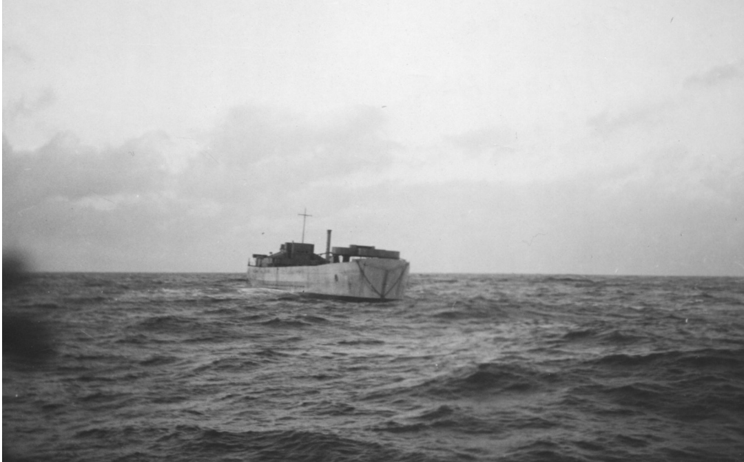
Figure 3. LST 3521 was towed out to sea, but a storm put the convoy off course, and they had to scuttle the ship short of the designated site. This photo was taken on 18 February 1946, shortly after Foundation Maritime's tugboat Franklin slipped the tow.