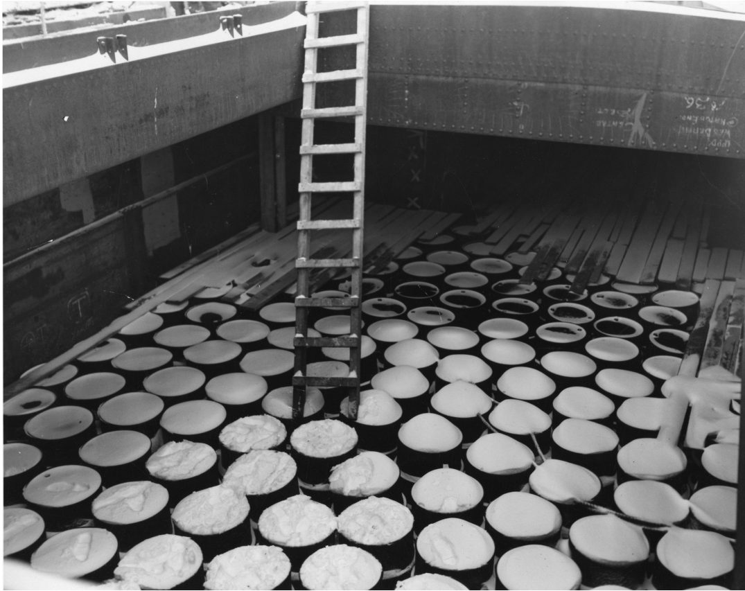
Figure 2. The drums of mustard gas were stowed in the cargo hold of Landing Ship Tank (LST) 3521, stacked vertically with planks placed between each row. Of the 10,982 barrels, 763 were found leaking which caused 5 minor injuries that were promptly treated by medical staff. During the voyage and scuttling, several drums were dislodged and sunk by rifle fire from Middlesex. This photo was taken on 31 January 1946, almost three weeks before Operation Mustard commenced.

practicality of using inland waterways. 46 Unfortunately, the dumping in Georgian Bay was not an isolated instance, as Canadian authorities periodically dumped surplus munitions in Lake Ontario and the US military dumped more than 2 million pounds of ammunition and other production wastes at several sites in Lake Superior. 47 Unexploded ordnance (UXO) from both Canadian and American military bases bordering the Great Lakes also remains a problem.