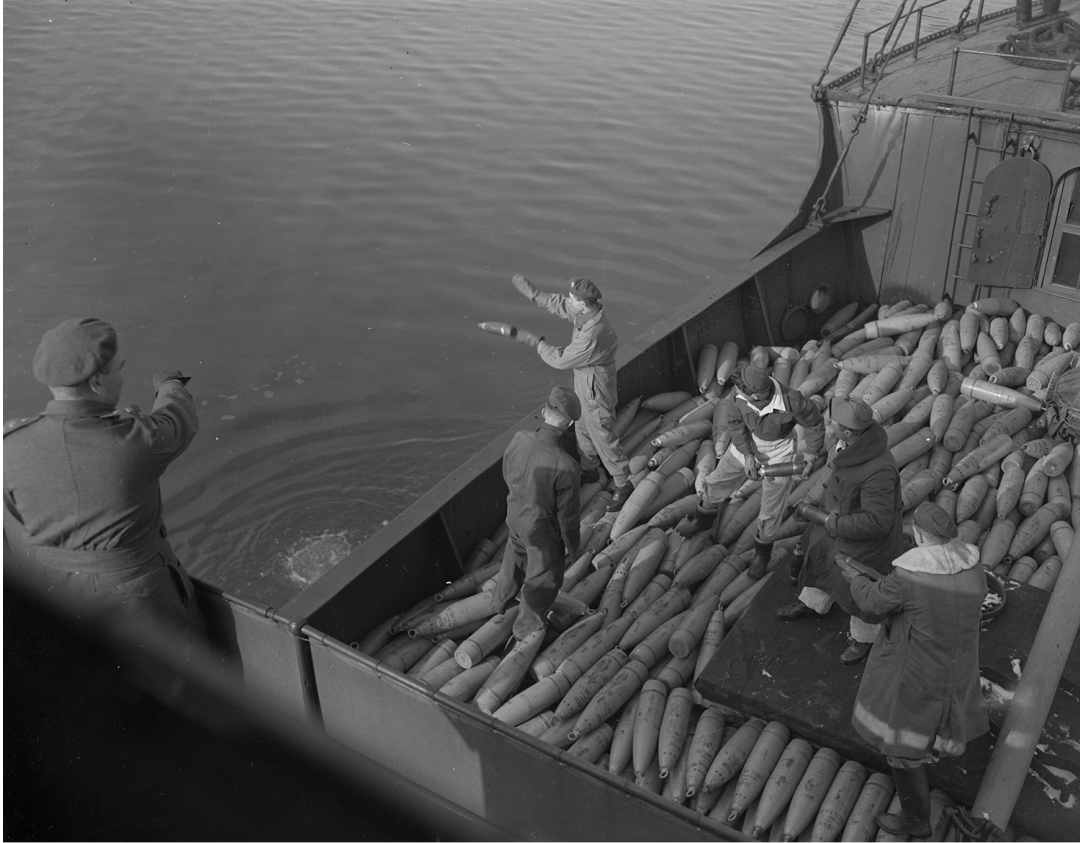
Figure 1. Troops from the Royal Canadian Ordnance Corps dumping munitions item-by-item from the tugboat Northern in Dyer Bay, roughly 2 miles off the coast of the Bruce Peninsula in Georgian Bay.

Shelburne depot to dump unserviceable ammunition that had either accumulated from de-storing ships or arrived from the Renous depot further inland. 44 However, it was not the only vessel servicing Shelburne. In October 1945, Jonquiere made four trips out to sea to dump ammunition and at least 375 depth charges. In December, 385 Minol-filled depth charges were put aboard HMCS Antigonish , Beacon Hill , and Levis to use as ballast before being dumped at sea. HMCS Arnprior also carried out dumping operations from Shelburne in February 1946. 45