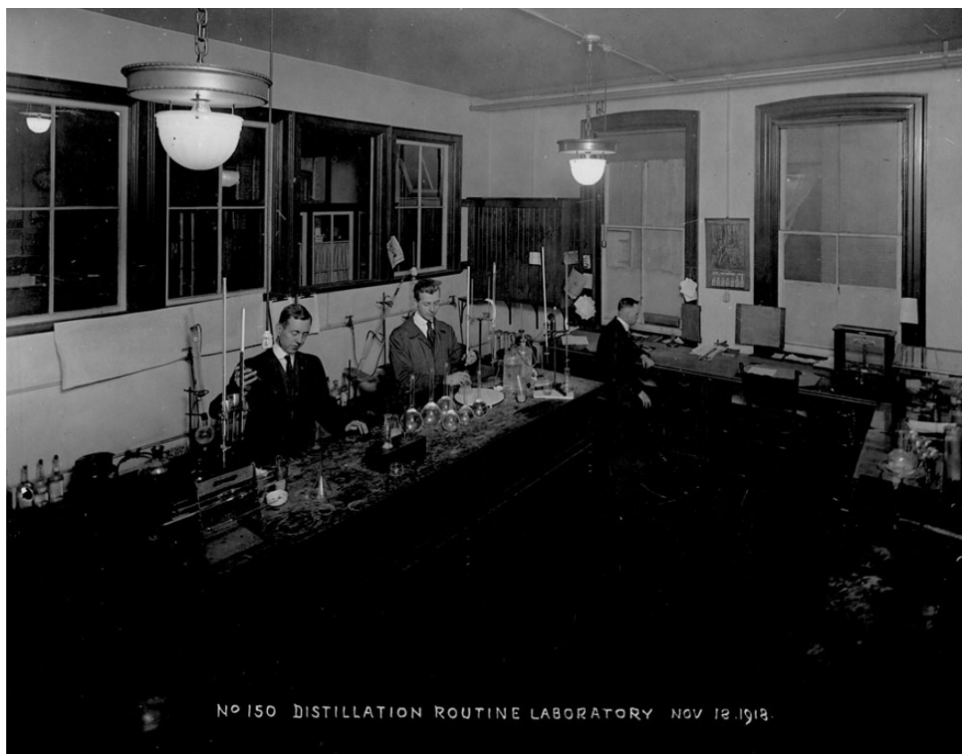
Figure 4. Distillation Routine Laboratory, British Acetones Toronto Limited, Department of Militia and Defence supplementary photograph collections, Vol. 68, No. 150, Library and Archives Canada (LAC).

of fermentation” had been installed (Fig. 4). As Speakman later describes, “It was only by going back to the earlier, more successful work in the laboratory, carried out under properly controlled conditions, that sound principles were formulated to guide the work in Toronto.” The IMB invested a further $1 million into refitting the plant with equipment capable of using the Weizmann process to convert grain into acetone. 43 By the following year, British Acetone had produced almost the entire quantity of acetone across the Entente nations. The dramatic uptake in this synthetic solvent resolved further issues with the British and Canadian supply for explosives manufacture, which had been affected by the disruption of the Entente’s trade networks.