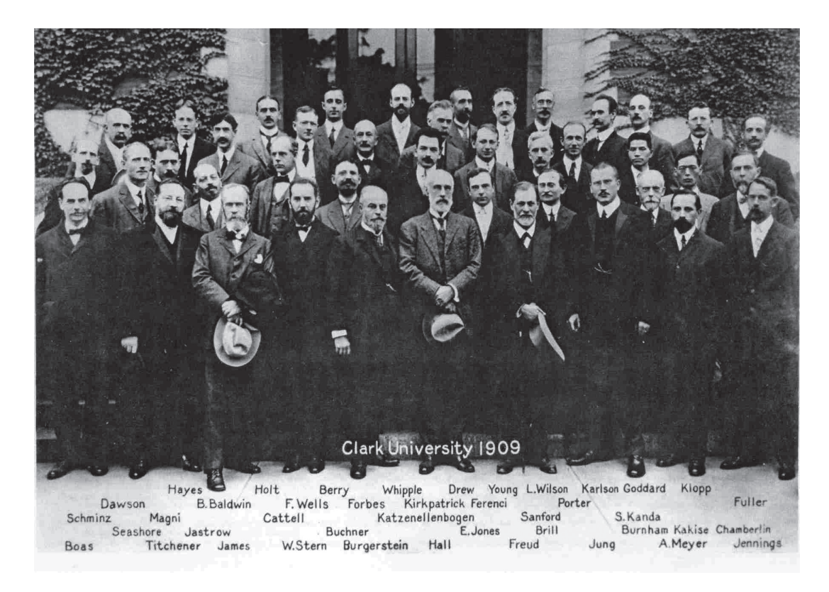
Figure 1: The Sixth Meeting of the Experimentalists, Clark University, 1909.