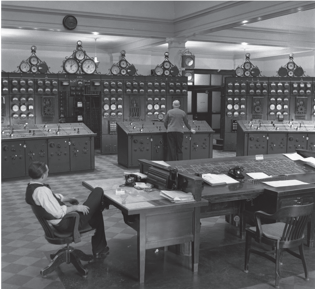
Figure 2. Control room of the Queenston hydro-electric plant.

At the end of the nineteenth century, hydropower seemed almost limitless. Falling water was treated as inexhaustible, because the technology had not yet advanced to the point where hydro stations could fully exploit the head of water at places like Niagara Falls. Moreover, this “white coal” burned clean compared to coal, oil, or biomass. Once the public adopted the attitude that hydro energy was infinite, both energy producers and governments used the material abundance of energy to lend legitimacy to a suite of policies that claimed to offer greater opportunities to its citizens, while simultaneously obscuring the inequitable division of the benefits of that abundance. Hydropower’s material bounty enabled the state to act as the benefactor, distributing electricity for use in an almost endless number of applications—even though most hydropower users in the first half of the twentieth century were a small group of industries and manufacturers. 30 In the process, these abundant applications led people to frame hydro-electricity as indispensable energy for a constantly growing number of Canadians and thus a feature of modern democratic society.