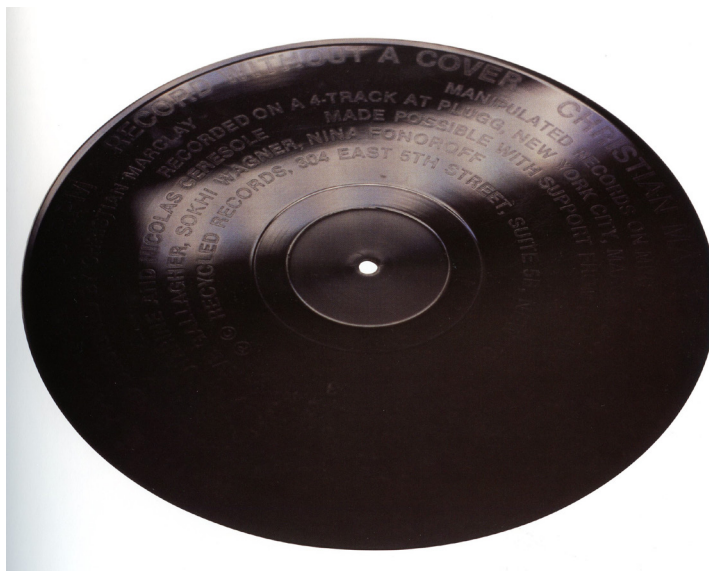
Figure 1: Christian Marclay, Record without a Cover (1985), black vinyl, first edition, 12 inches (30.4 cm) diameter. © Christian Marclay. Courtesy Paula Cooper Gallery, New York.

not because I am interested in “pure” theoretical destruction (for example, Martin Heidegger’s “ Destruktion ” of Western metaphysics), but because destruction as a link between medium and message calls for types of conceptual precision that theory seeks to provide. At issue here are the senses of destruction that converge in aesthetic practice, senses that can be isolated outside and inside Marclay’s corpus, where both in his turntablist performance on Sanborn and Holland’s Night Music in 1989 and in “Guitar Drag” ten years later, different but related articulations of sound and destruction appear. Art (and) destruction re(in)volve him.