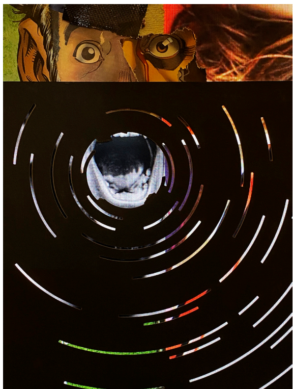
Figure 4: Christian Marclay, Untitled (Concentric Waves) (2020), digital chromogenic print, 31 1/2 x 23 5/8 in. (80 x 60 cm). © Christian Marclay. Courtesy Paula Cooper Gallery, New York.

The Fraenkel Gallery in San Francisco, California has long been interested in the convergence between the LP record and art. In 2018, it hosted a show curated by Antoine de Beupré called, “Art and Vinyl. Artists and the Record Album from Picasso to the Present.” The show included everything from Picasso’s dove that adorned a collection of songs by Paul Robeson, to a copy of Marclay’s Record Without a Cover . However, more recently, in spring 2021, The Fraenkel mounted a show of Marclay’s then-most current works, including the collage shown above. This piece, Untitled (Concentric Waves) , appears among a sequence of similar works characterized thus by the gallery: