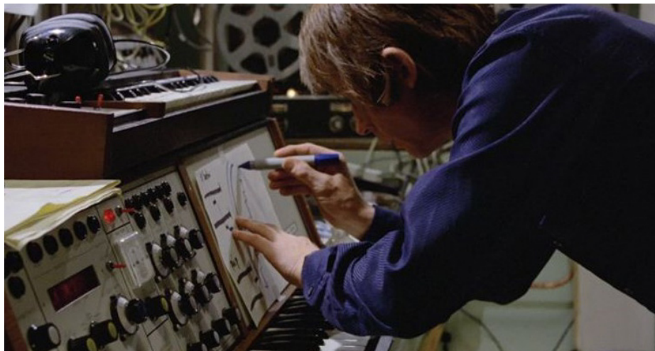
Figure 12: Audio technology and possibility. The Shout (Jerzy Skolimowski, Recorded Picture Company, 1978).

seems to signal the force of the vertical (Ahmed 2006, p. 107). 47 The shout therefore demands a queer orientation for its successful generation. In this, it echoes the scream in Bacon's paintings. In Bacon's paintings, the scream registers pleasure, it is an effect of queer sexual practices. The shout in the film, by contrast, is not a record of ecstasy but its cause . Anthony is overcome by Crossley's noisy ejaculation, falling in a faint, a sonically induced swoon. 48 The other men who buckle at Crossley's shout can similarly be read as exhibiting post-coital quiescence, as victims of a little death ( la petite mort ), rather than of the literal death a straight reading of The Shout invites. 49