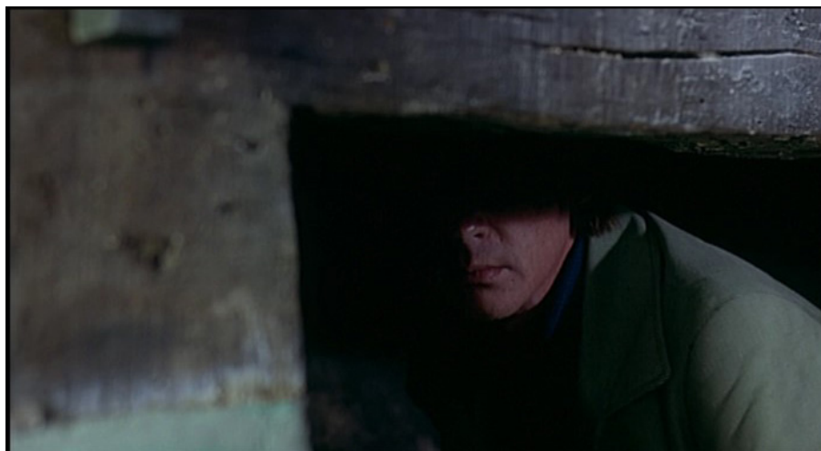
Figure 9: Tableau vivant . The Shout (Jerzy Skolimowski, Recorded Picture Company, 1978).

These tableaux vivants function as more than props or prompts (Figure 8; Figure 9). 21 Going beyond supporting character development and aiding the film narrative, they function to draw attention to the queer potential of Bacon's paintings. In this role, they contribute to the film as art writing. Art writing is writing about art that does not seek to explicate but rather, as a practice, to realize (something about) a work by way of processes akin to repetition or imitation (Rifkin 2021, p. 233). 22 This practice bears some similarity to Serge Cardinal's description of a mode of film writing that allows a film to speak for itself through the writer talking in its language.