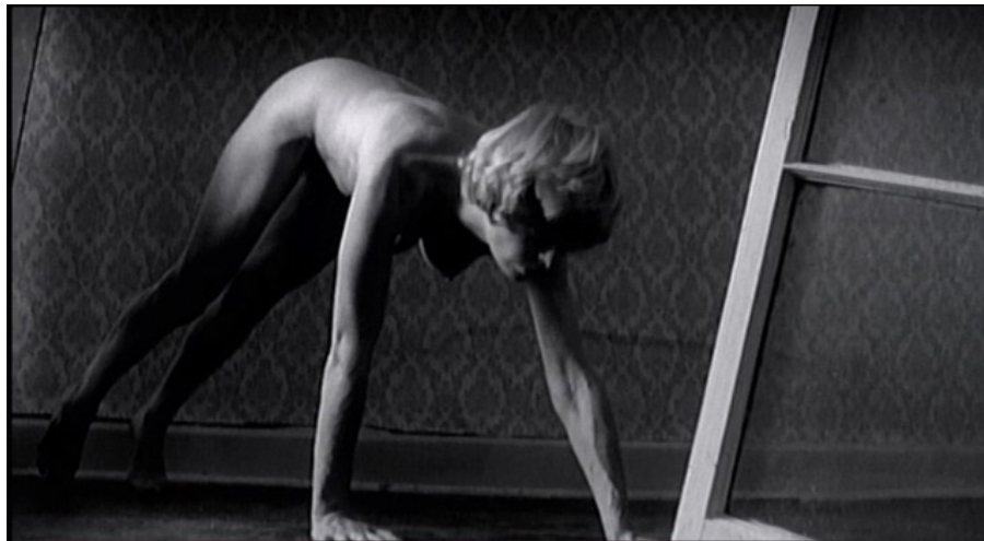
Figure 8: Tableau vivant . The Shout (Jerzy Skolimowski, Recorded Picture Company, 1978).

Another film that alludes to Bacon in complex ways is Herostratus (dir. Don Levy, UK, 1967), in which stills of the central character, Max, show him with his face blurred and distorted in poses that are reminiscent of portraits by the artist. 20 At one point, these stills are intercut with a scene of a leather-clad woman strolling with an umbrella. The woman with the umbrella is a recurring presence in Herostratus as is footage of slaughterhouses and meat lockers, incrementally calling to mind Bacon's Painting of 1946 which depicts a figure overshadowed by an umbrella, against a backdrop of a hanging carcass. There is also a scene on a set for a commercial that includes a shot of Max in shadow surrounded by scaffolding, the image redolent of Bacon's Head VI . Such visual affinities are employed cumulatively to reinforce a sense of Max's existential angst. The film also juxtaposes an erotic dance with the slaughter of a cow in a way that resonates with Bacon's delight in fleshy stagings of violence. Like The Dark Knight and The Shout , Herostratus can thus be read as an affective homage to the painter.