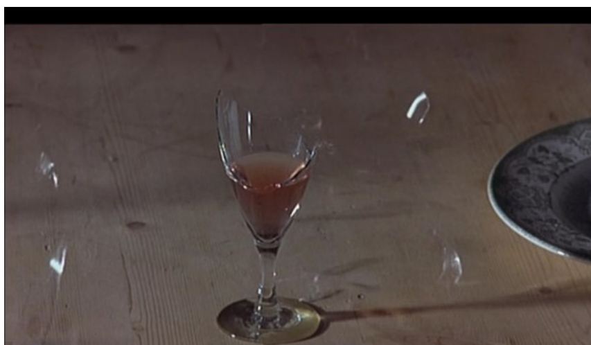
Figure 2: Shattering a glass with sound. The Shout (Jerzy Skolimowski, Recorded Picture Company, 1978).

Acoustic phenomena, such as glass shattering and doors slamming, are repeated (Figure 2). Sounds of insects buzzing and of the wind blowing recur. The Shout exploits the emerging sound technology of Dolby Stereo to craft the score and the shout. 3 When first released, it was an acoustic cinematic event, showcasing Dolby's capacity to reshape audience perceptions regarding the importance of film sound. Skolimowski has discussed the use of Dolby to create the yell, noting that the main sound was of "a man shouting like hell" but that this was one of 40 or more tracks that were combined to produce the intense vocalisation that is the shout. The other tracks included sounds such as "Niagara Falls, the launching of the Moon rocket, everything" (Strick 1978, p. 147).