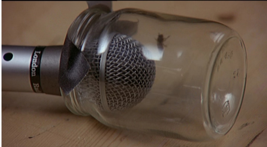
Figure 3: The sound of a wasp buzzing. The Shout (Jerzy Skolimowski, Recorded Picture Company, 1978).

The film The Shout also differs from the story in that the modern artist Francis Bacon is a central point of reference. 5 In 1929 when ‘The Shout’ was first published, Bacon was an interior designer creating furniture. The only art referenced in the short story is seemingly classicist. In Graves’s tale, Rachel tells Richard she had a dream similar to his, about a Black man “who wore a blue coat like that picture of Captain Cook” (Graves 2008, p. 9). 6 The Black man in the blue jacket, part of naval dress uniform, also appears in the film adaptation. The actor in this non-speaking role is uncredited, another nameless ‘exotic’ extra burdened with representing alterity. 7 The First Nations Australian of the film, as a figment of the European imaginary, functions to signal primitivism, to stand for mystery and difference. The shout from which the film takes its title is said to originate with this man, it is a vocal skill that Crossley learnt while living with First Nations Australians and has now brought back to England. Acoustic references to the music of Australia’s First Peoples are also present. In one scene, Rachel is cutting roses and the noise of a wasp buzzing