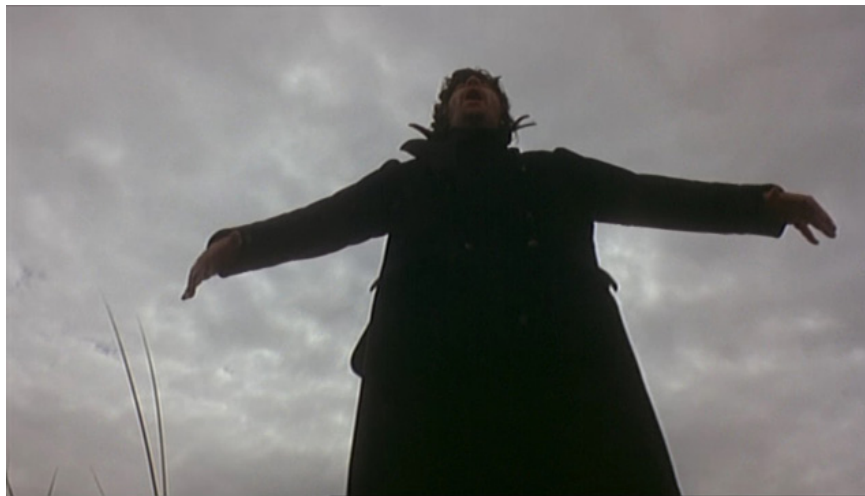
Figure 10: A performance of tumescence . The Shout (Jerzy Skolimowski, Recorded Picture Company, 1978).

In Skolimowski’s film, Crossley’s shout does not readily conform to any of these definitions. He does not seem to shout words thus his shouting is divorced from