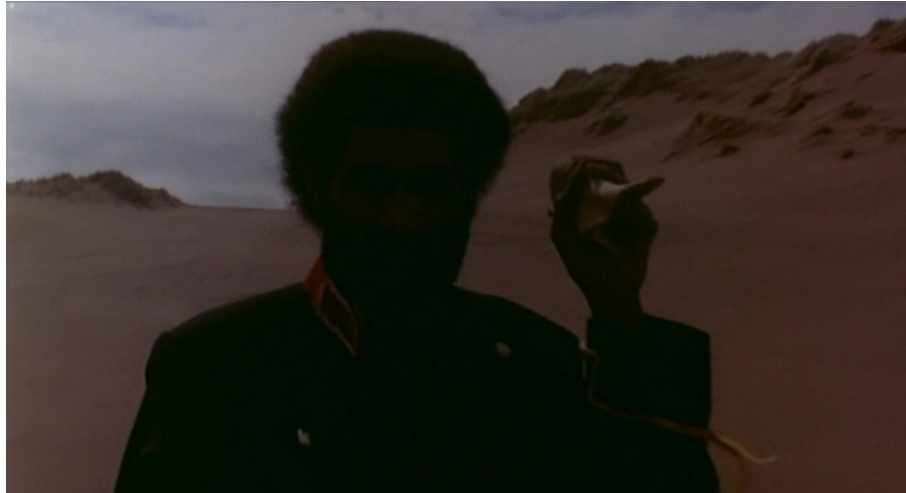
Figure 4: Bone pointing. The Shout (Jerzy Skolimowski, Recorded Picture Company, 1978).

There is no shout practiced among Australia's First Nations peoples. Unlike Graves's short story, however, the film does reference a known practice, bone pointing (which was performed by kurdaitcha men in the Northern Territory into the 1950s) (Figure 4).