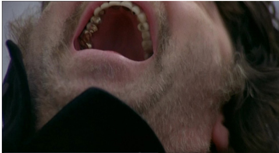
Figure 11: A black hole. The Shout (Jerzy Skolimowski, Recorded Picture Company, 1978).

This emptiness is what grants the shout its queer potency. Although, as alluded to earlier, the shout is a symptom of xenophobia, a sonic shorthand for the fear of Otherness, it also operates in excess of that fear, drowning it out. 45 Vacated of meaning, Crossley's mouthing becomes a come hither to the sign, inviting sense to come to be. Through this, the shout carves out a space of queer possibility within the outwardly heteronormative dynamics of the film. As a hole the mouth is a substitutable opening (or point of egress) that can stand for itself or for the anus or the vagina or another orifice, it acts as a potential locus of attraction and sexual satisfaction. Crossley sucks and blows to shout, takes in and gives out; he is open to multiple interpretations, encouraging multifarious desires and their fulfilment. 46