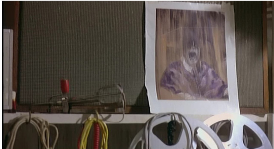
Figure 5: Francis Bacon, Head VI, 1949. The Shout (Jerzy Skolimowski, Recorded Picture Company, 1978).