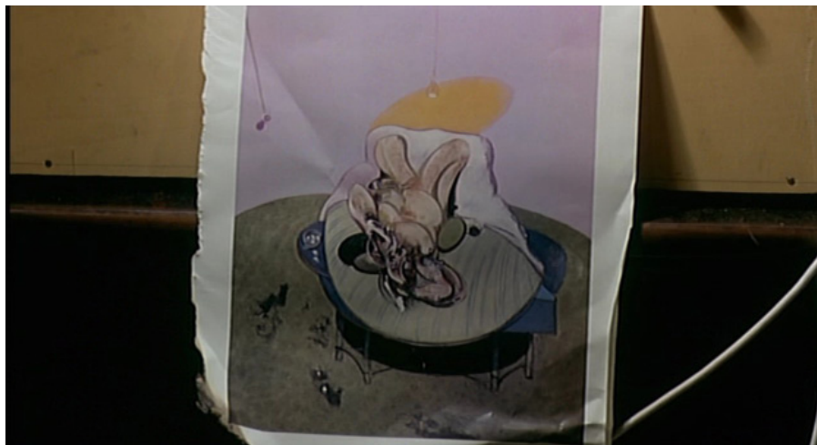
Figure 6: Francis Bacon, Lying Figure, 1969. The Shout (Jerzy Skolimowski, Recorded Picture Company, 1978).