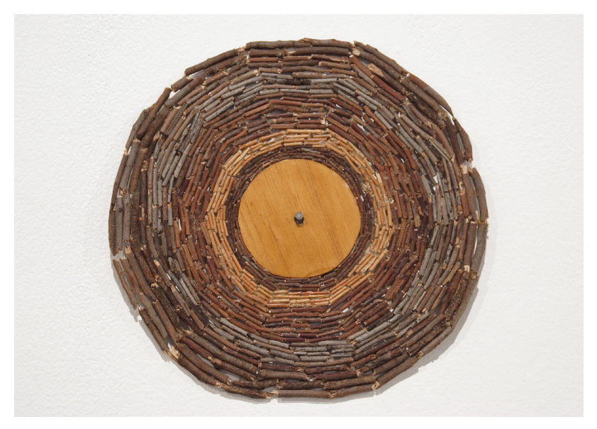
Figure 4: Vicky Browne, Dead Wood (2006).

Before media theorists started to think about insect media in the form of shellac records, petro-capitalism and vinyl LPS, the environmental impact of the cloud, and coal's implicit relationship to media, artist Vicky Browne was already making eco-sonic media. Browne's reoccurring trope of producing unexpected sounds from unlikely materials is often formed in sonic media. Recordings of bird songs are lathe cut into copper discs, whose soft, malleable surfaces easily take on their sonic vibrations and are just as easily worn down to grooves of metallic rasp. Damaged and degraded magnetic tape is repurposed as a wig-like structure; no longer reliant on a tape player, the strips of tape live a second life as rustling plastic. A turntable atop a rocking chair-like device tries to play a Kraftwerk LP; the needle rocks on and off the record, jumps, skips, and slides. A spinning wheel spins the Australian classic "Down Under," the phonograph formed from a needle and a paper cone. There's nostalgia in these works: familiar records play, and there is the constant reminder of outmoded technologies, such as cassette tape, compact discs, and cheap thin vinyl.