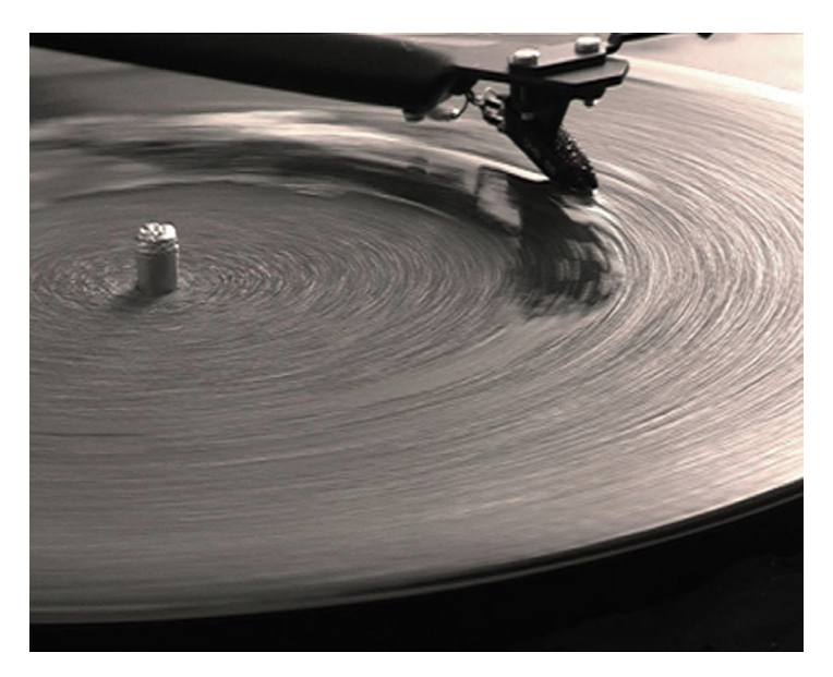
Figure 3: Katie Paterson, Langjökull, Snæfellsjökull, Solheimajökull (2007). Film still © Katie Paterson.

Katie Paterson's Langjökull, Snæfellsjökull, Solheimajökull (2007) is a sonic media artwork that draws on the ability of recording media to displace time and space. The work was produced from recordings of three glaciers in Iceland: Langjökull, Snæfellsjökull, and Solheimajökull. These recordings were then pressed into three records, made of ice, each of which was produced using the meltwater from the corresponding glacier. These ice discs were then played simultaneously on three turntables until they melted completely.