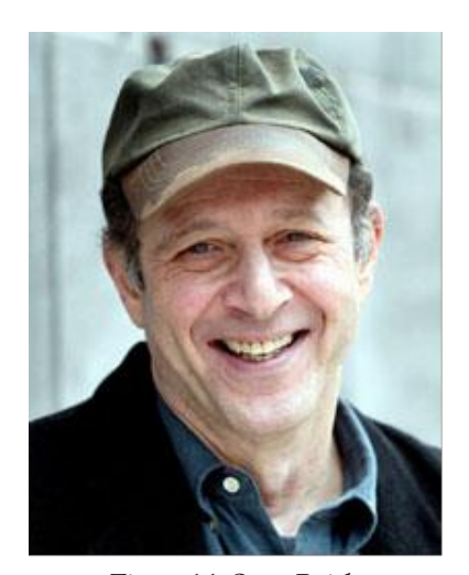
Figure 14: Steve Reich.

You don't feel the ghost of Wagner leaning on your shoulder... you feel the presence of Debussy and Ravel... So the French connection runs deep. With the exception of Charles Ives, who is really more Germanically oriented, actually, it seems to me, our most important, most famous (historically) American composers come out of the French tradition... I know I've heard people say, 'Oh, Charlie Parker has heard Debussy...' I think bebop in general is definitely somehow a cousin of French impressionism.