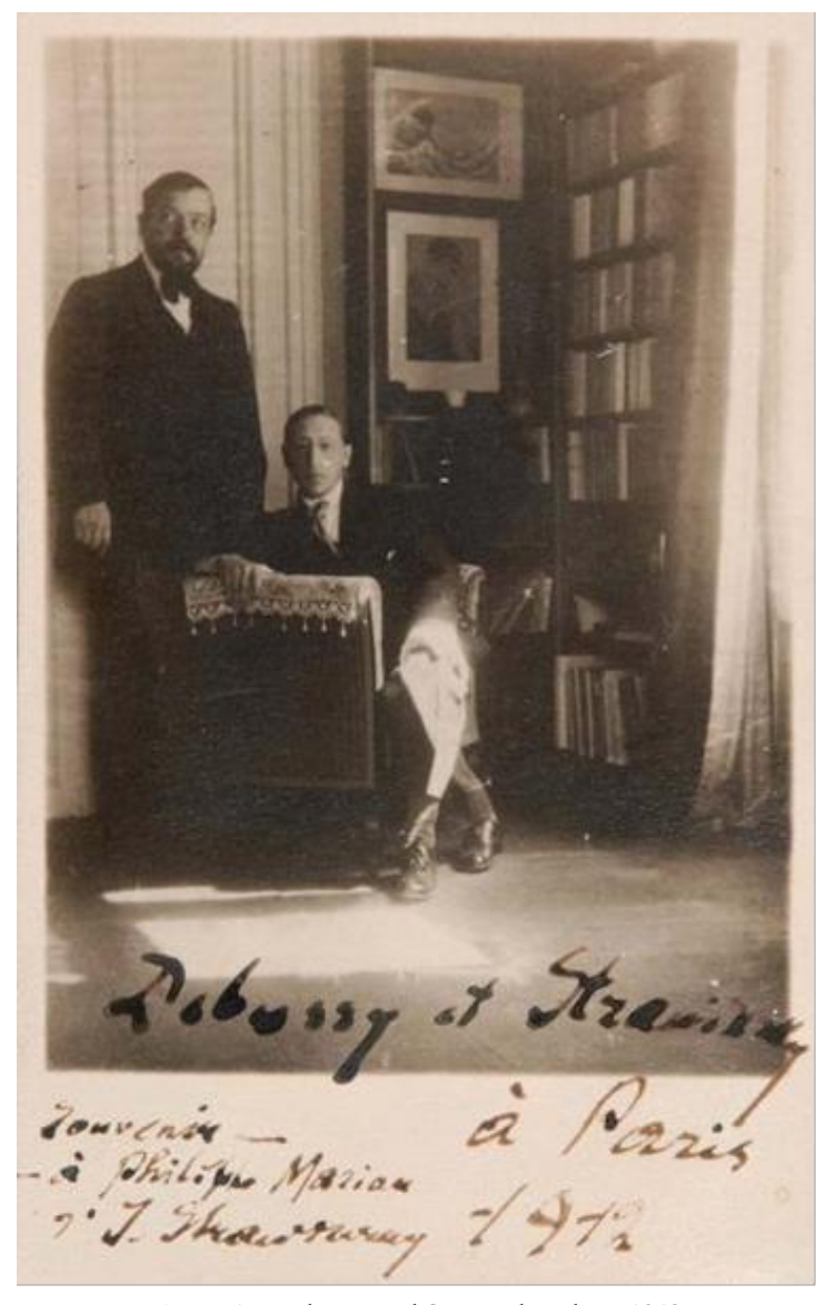
Figure 15: Debussy and Stravinsky, photo 1912.