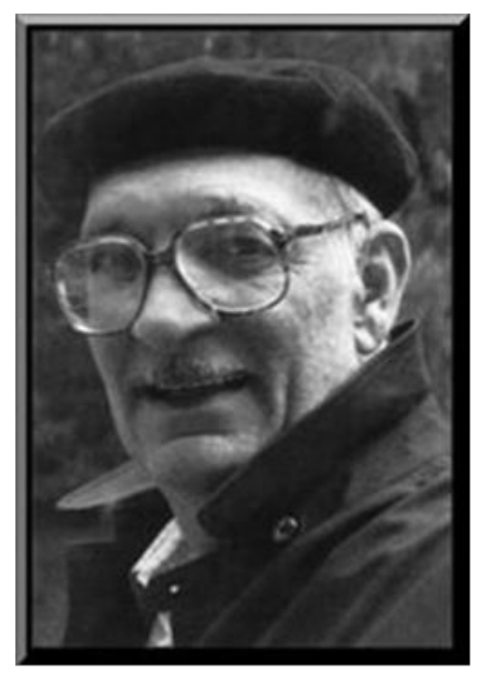
Figure 4: George Crumb.