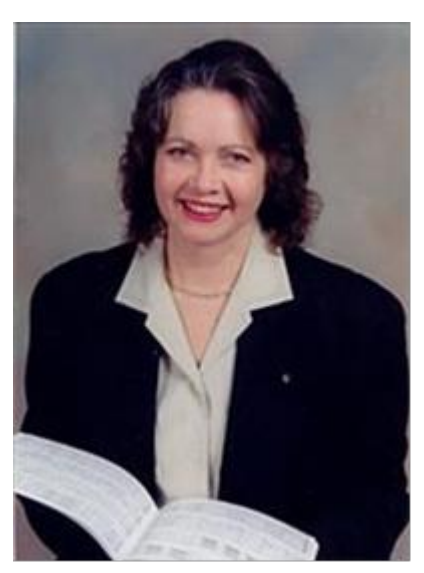
Figure 8: Ellen Taafe Zwilich.

I wouldn't say all music of the present [departs from and carries a narrative] because one of the delicious things about living in the 21st century, one of the few , is the fact that my colleagues are all so different. So I would never speak for anybody, but for me it is a narrative, whether a literal story, poem, or some image.