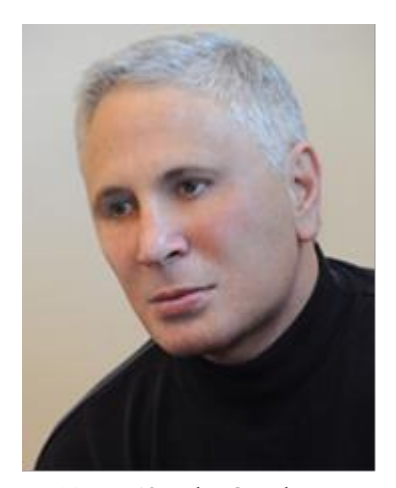
Figure 13: John Corigliano.

However, John Corigliano hears less of expected forming but is moved by Debussy's seemingly conscious rejections: