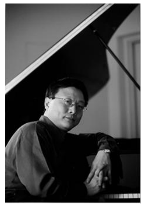
Figure 10: Bright Sheng.

Ellen Zwilich sees growth by color differentiation as an essential forming process: Timbre is an agent of form, a building block." [I had inquired into such a procedure in Symphony No. 4, The Gardens .] Zwilich continued: