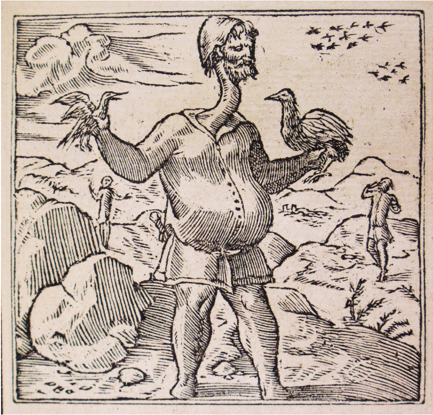
Figure 1. Alciati, Andrea, 1492–1550: Emblemata Andreae Alciati . – Lugduni: apud Gulielmum Rovillum, 1548, fol 74r. Universitätsbibliothek Wien, University of Vienna.