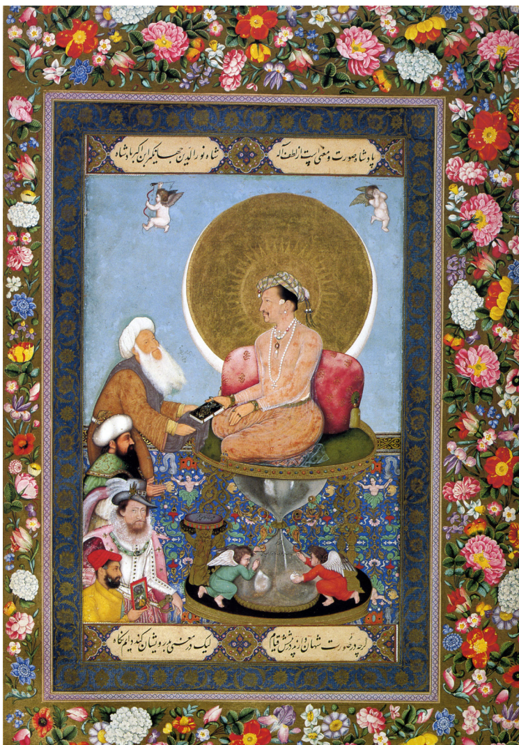
Figure 2. Jahangir Preferring a Sufi Shaikh to Kings, by Bichitr, ca. 1615–1618, Mughal India, from the St. Petersburg Album, margins 1747–48, opaque watercolour, ink, and gold on paper, 48.0 x 33.0 cm, Freer Gallery of Art, Smithsonian Institution, Washington, DC, inv. no. F1942.15a.