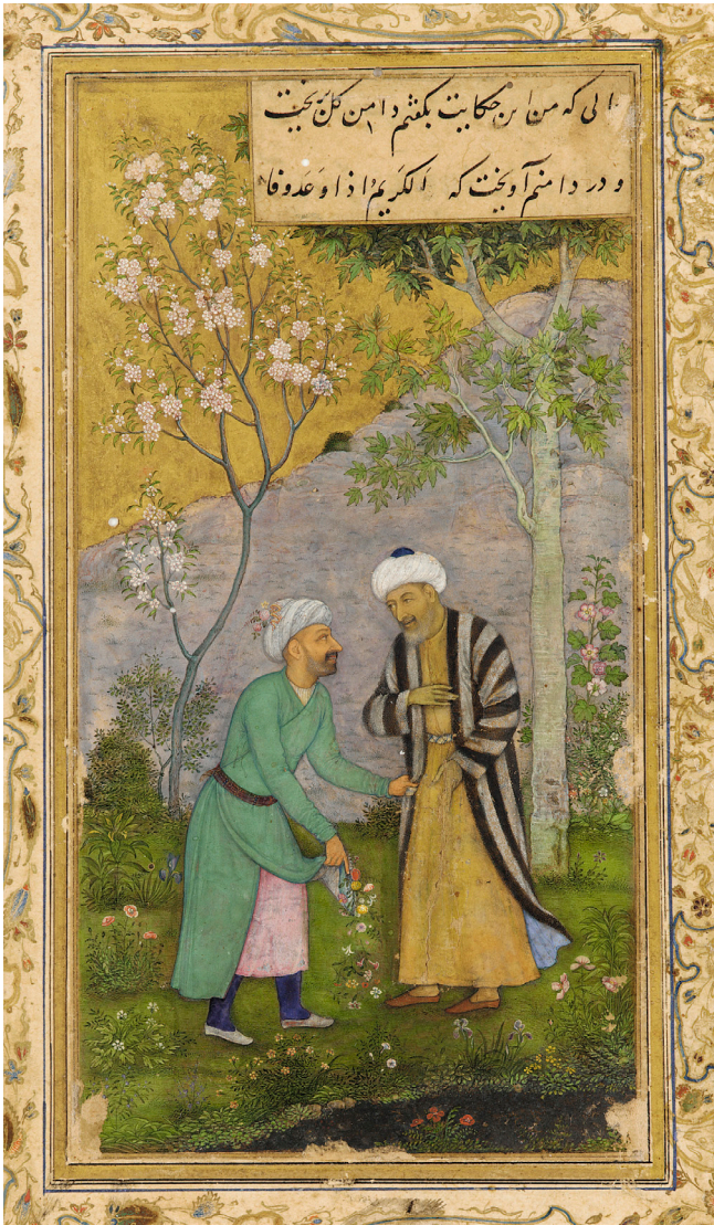
Figure 3. Sa'di in the Rose Garden, by Govardhan, Gulistān, India, ca. 1630–45, Mughal India, ink, gold, and opaque watercolour on paper, 12.9 x 6.7 cm, Freer Gallery of Art, Smithsonian Institution, Washington, DC, Gift of the Art and History Trust in honour of Ezzat-Malek Soudavar, inv. no. F1998.5.6.