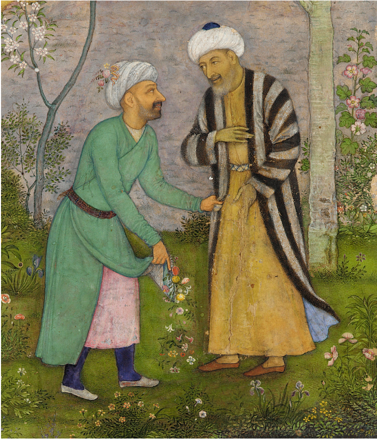
Figure 3.1. Detail of Sa'di in the Rose Garden.