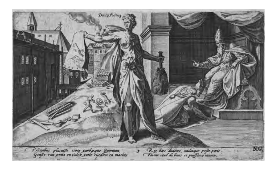
Figure 3. Wealth and Power Making their Entry into Society. Collection Rijksmuseum, Amsterdam