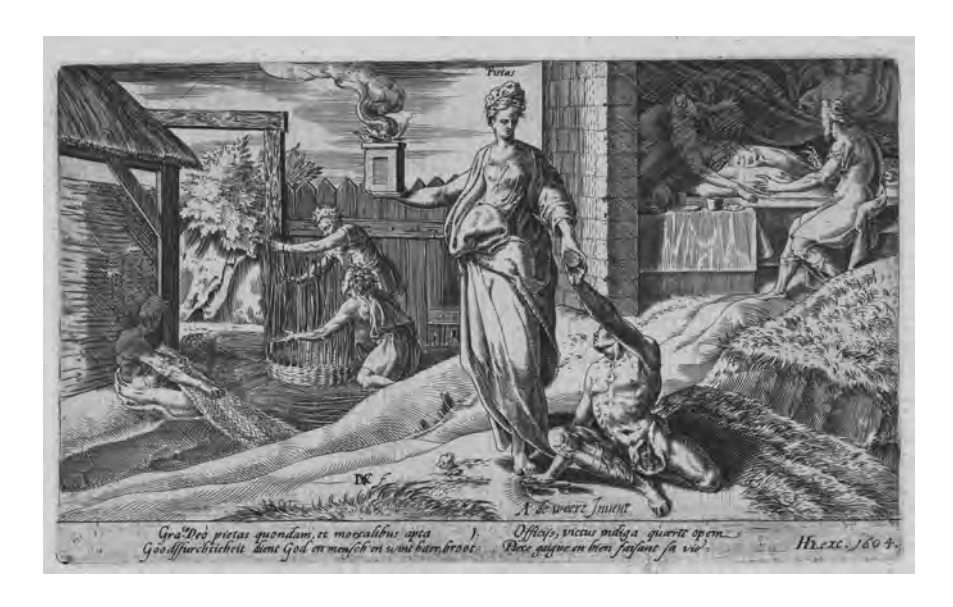
Figure 1. Man Piously Doing his Duty. Collection Rijksmuseum, Amsterdam