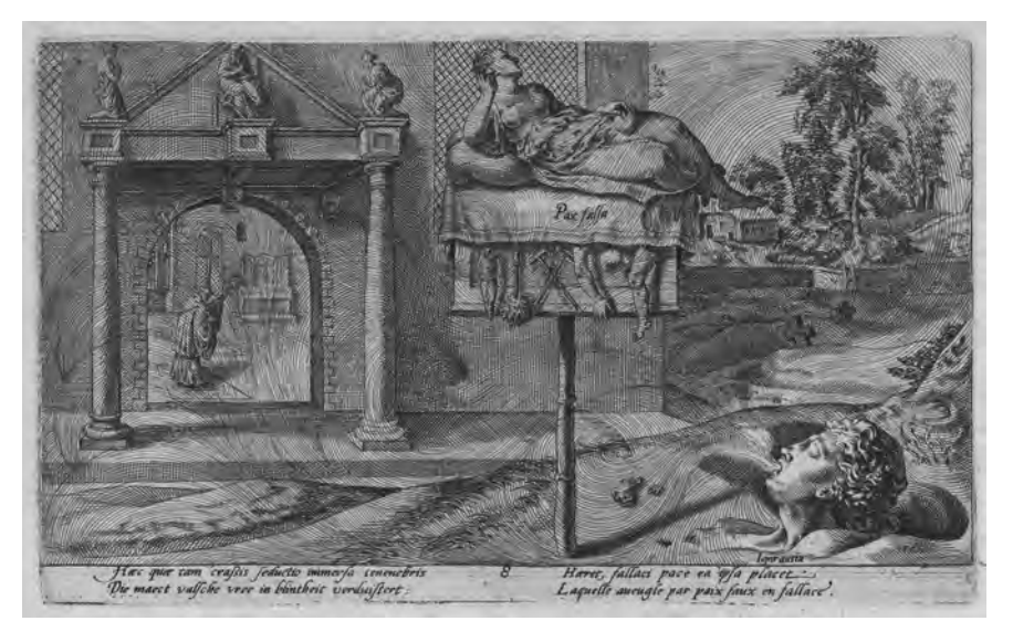
Figure 8. Ignorance Concealing the Falsehood of Peace. Collection Rijksmuseum, {\bf Amsterdam}