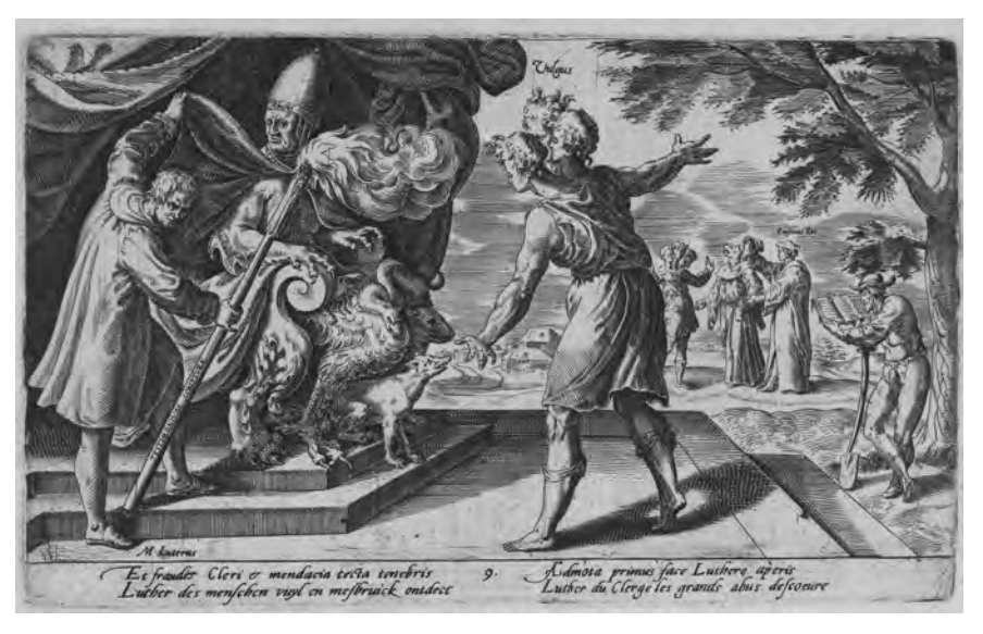
Figure 9. Martin Luther Revealing the Deceit of the Catholic Clergy. Collection Rijksmuseum, Amsterdam