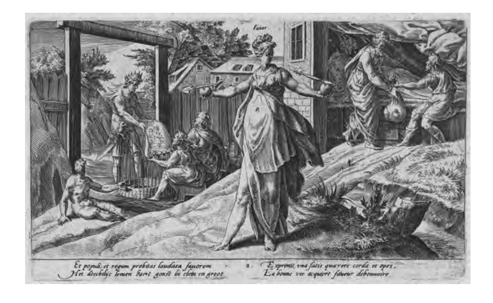
Figure 2. Man Rewarded for his Piety. Collection Rijksmuseum, Amsterdam