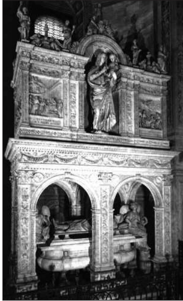
Illustration 1. Gian Cristoforo Romano and Benedetto Briosco, Monument to Gian Galeazzo Sforza, Certosa di Pavia, Pavia.