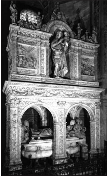
Illustration 1. Gian Cristoforo Romano and Benedetto Briosco, Monument to Gian Galeazzo Sforza, Certosa di Pavia, Pavia.