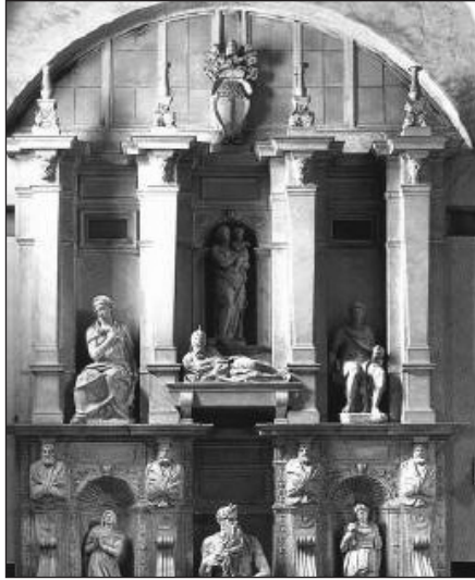
Illustration 2. Michelangelo, Tomb of Julius II , Church of San Pietro in Vincoli, Rome, c1545.