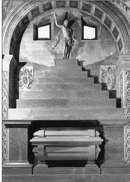
Illustration 5. Giulio Romano, tomb of Baldassare Castiglione, church of Santa Maria delle Grazie, Mantua, 1530s.