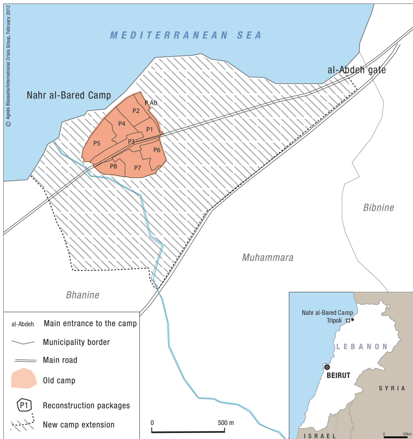
Figure 1. Nahr al-Bared refugee camp, inset map of Lebanon