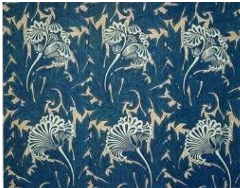
Fig. 4: William Morris, “Corn Cockle”

What are all the little pieces of the pattern doing, pushing and pulling against each other? 9 One feature common to many forms of panpsychism, both Victorian and contemporary, is a syndrome one philosopher has called “smallism” (Coleman, 40-44). Smallism is the tendency to assume that truth resides in the smallest particulars of reality. The tiny units or bits of miniature or “low”