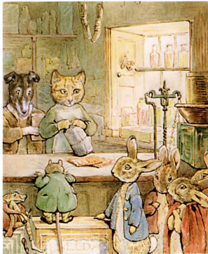
Fig 1: illustration from Ginger and Pickles

properties flow from a thing's essence, which itself hails from a remoter concept of being. In Butler's version of panpsychism, she says, "desire binds you to the wheel of life. Desire shapes your destiny for you within the wheel" (332). It may be appealing to our sense of individuality and free will, perhaps, to imagine a world in which everything makes itself from the inside out—babies their eyelashes, cats their fur, hens their feathers—but it is not so. It is of course as whimsical to imagine babies, hens, and cats buying their properties at an ontological bazaar as it is to imagine them making them: it sounds like a twisted, cosmic version of a story by Sinclair's contemporary, Beatrix Potter.