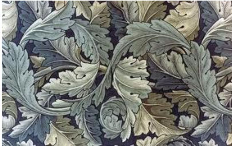
Fig. 5: William Morris, “Acanthus.”