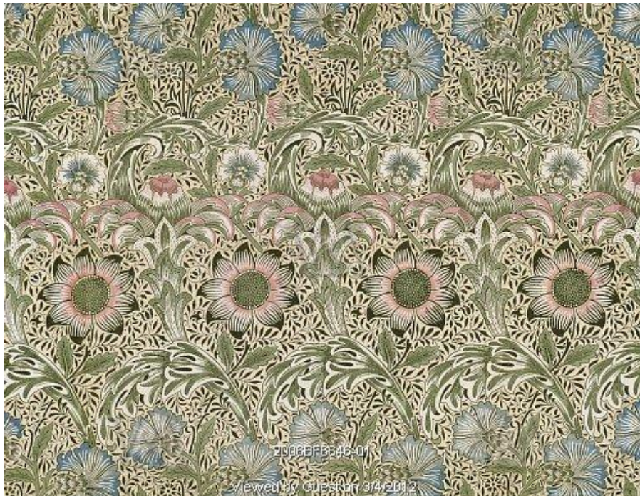
Fig. 3: William Morris, “Tulip”