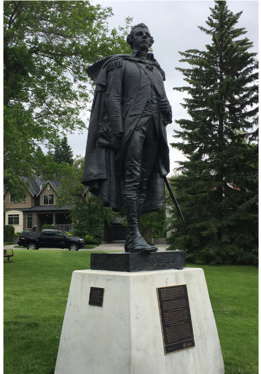
Figure 4. John Massey Rhind, Monument to Wolfe , 1898. Bronze and concrete, 470 × 152 × 160 cm. Calgary, City of Calgary Public Art Collection.