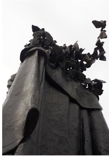
Figures 5–6. Brandon Vickerd, Wolfe and the Sparrows , 2019. Bronze and concrete, 488 × 152 × 182 cm. Calgary, City of Calgary Public Art Collection.

exchanges had a social feel and often began with a reflection on how the community of Inglewood had changed, as opposed to what a work of public art could contribute to the community. Community members proved to be generous during these consultations, with clear opinions on the direction the public art should take. Many expressed an earnest desire to foreground themes and ideas that addressed the complex history of the site and Calgary.