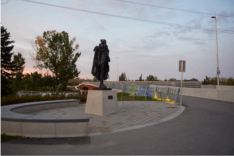
Figures 1–2. Brandon Vickard, Wolfe and the Sparrows , 2019. Bronze and concrete, 488 × 152 × 182 cm. Calgary, City of Calgary Public Art Collection.