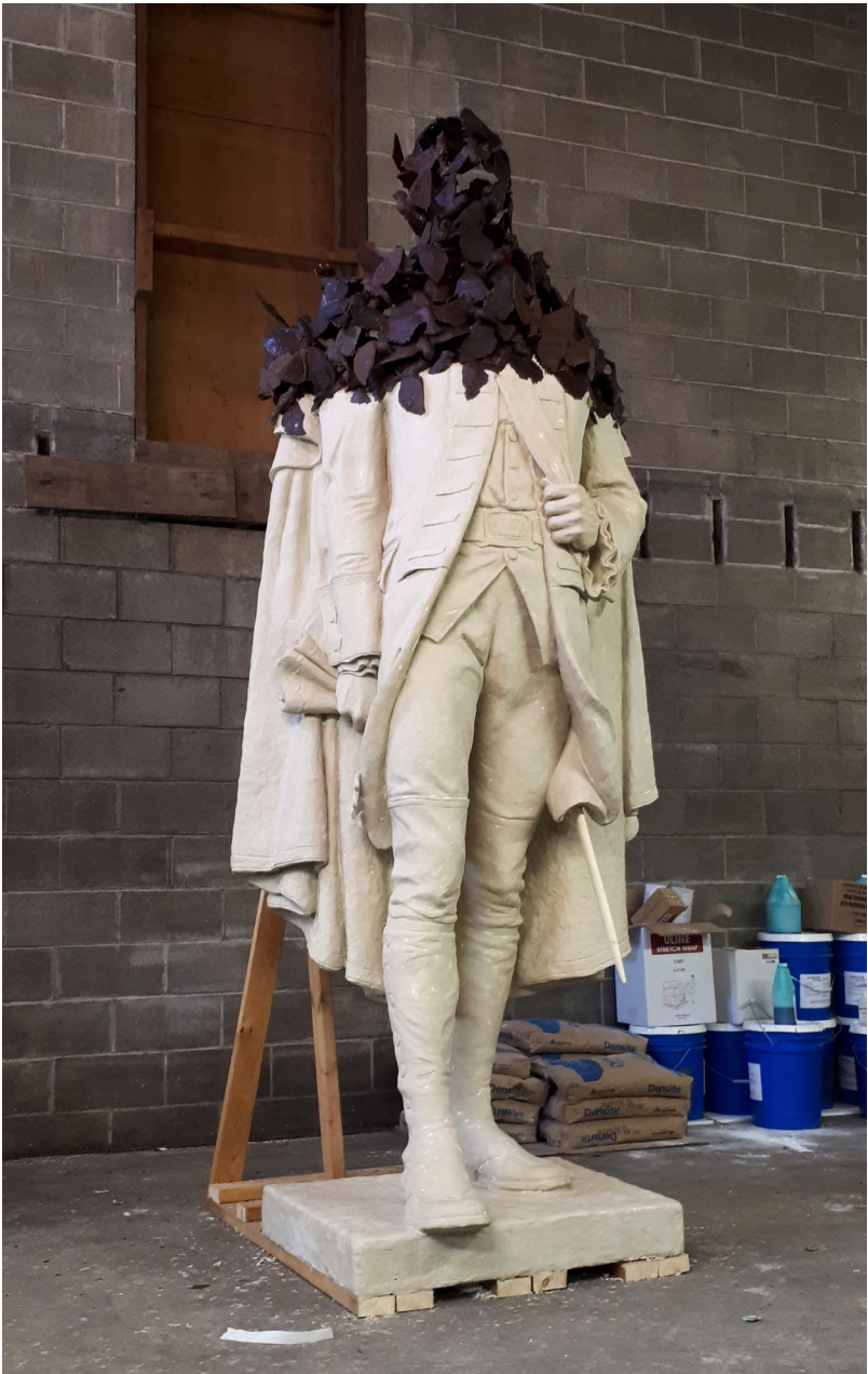
Figure 7. Brandon Vickard, Wolfe and the Sparrows (in progress), 2017. Foam, wax and wood, 488 × 152 × 182 cm.