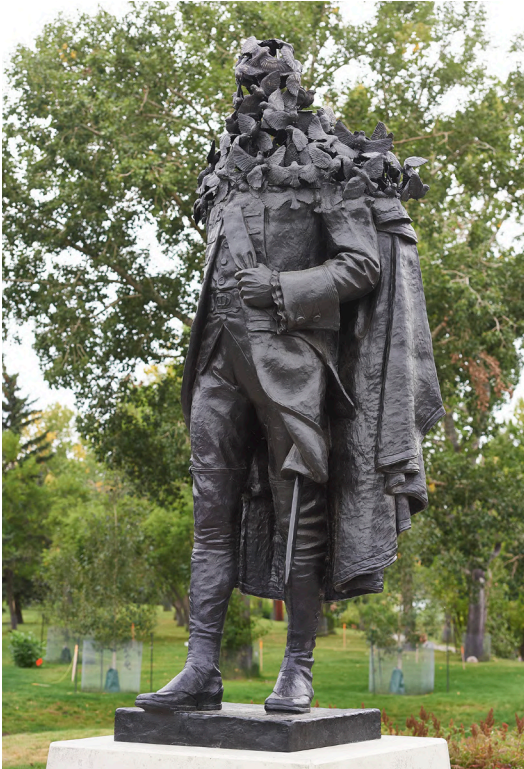
Figure 3. Brandon Vickerd, Wolfe and the Sparrows , 2019. Bronze and concrete, 488 × 152 × 182 cm. Calgary, City of Calgary Public Art Collection.