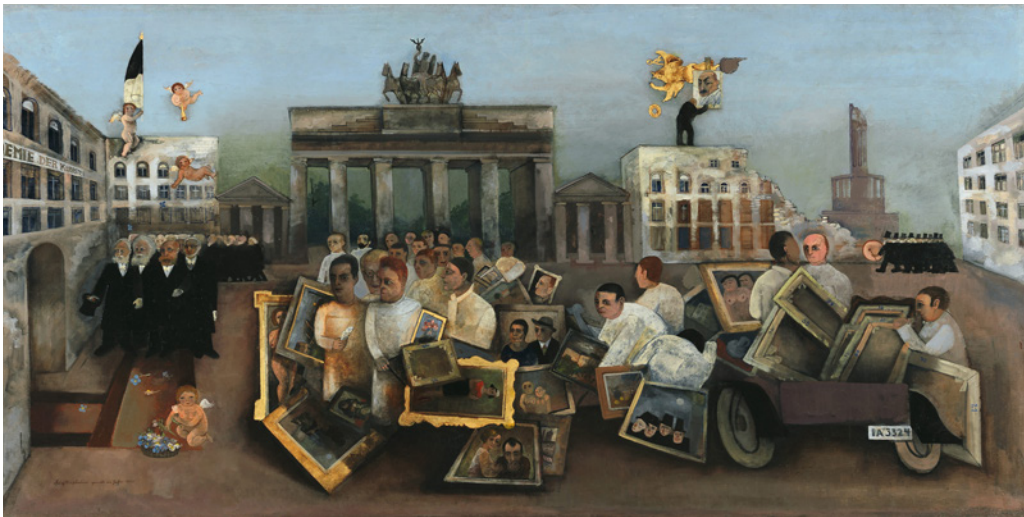
Figure 6 (above). Felix Nussbaum, The Mad Square , 1931. Oil on canvas, 97 × 195.5 cm. Berlinische Galerie, Berlin. Inv. BG-M 8/75.