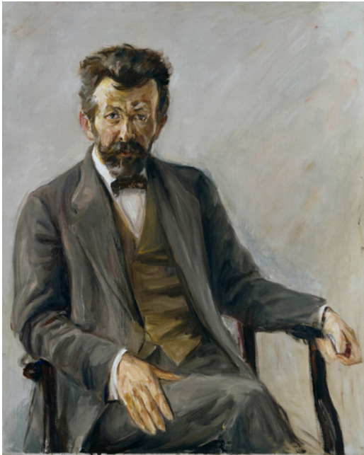
Figure 3. Max Liebermann, The Poet Richard Dehmel , 1909. Oil on canvas, 115 × 92 cm. Hamburger Kunsthalle, Inv. no. 1592.