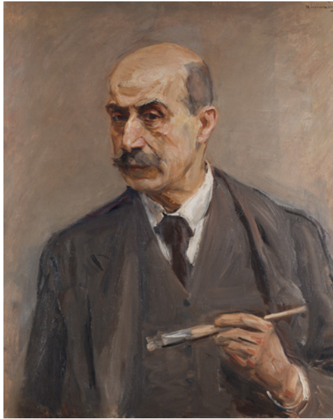
Figure 9 (opposite, left). Max Liebermann, Self-Portrait in a Suit , 1916. Oil on canvas, 94 × 73.7 cm. Niedersächsisches Landesmuseum, Hannover, Inv. no. KM 1918,10.