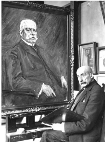
Figure 5. Max Liebermann in his Atelier at Pariser Platz 6 with his portrait of Paul von Hindenburg, ca. 1927.