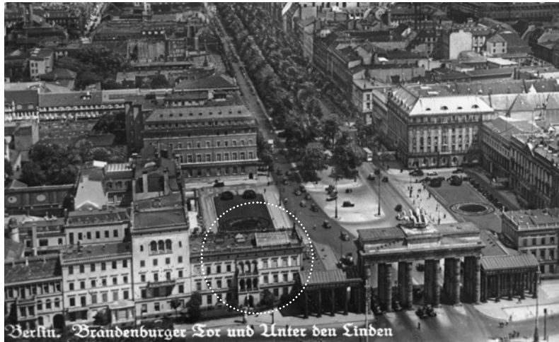
Figure 1. Berlin, Brandenburg Gate and Unter den Linden (with the Pariser Platz), 1931. Max Liebermann's house is circled in the photo.