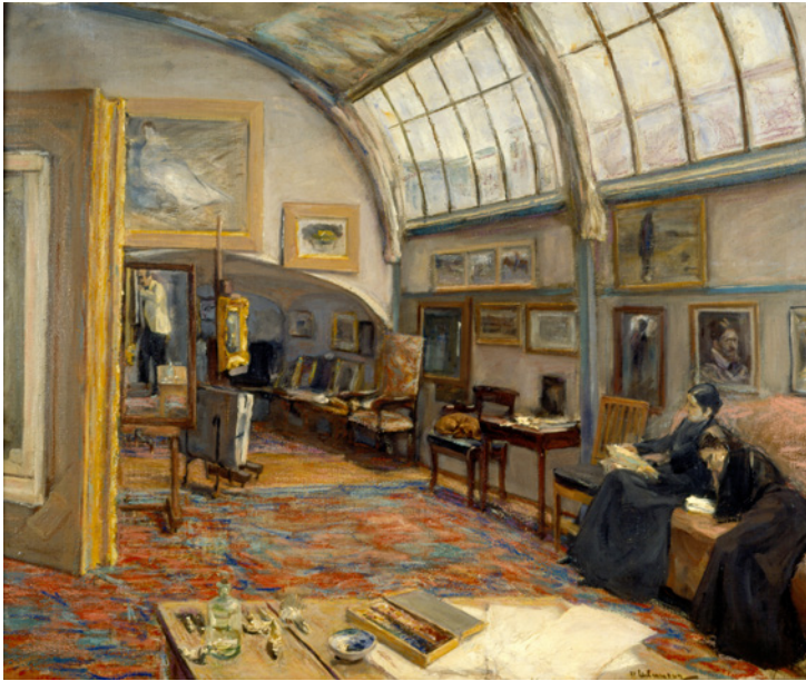
Figure 2. Max Liebermann, The Artist's Atelier , 1902. Oil on canvas, 68.5 × 82 cm. Kunstmuseum St. Gallen.

home next to the Brandenburg Gate. Liebermann's atelier was not constructed without controversy. Designed by architect Hans Grisebach in 1894, the atelier, which extended through the roof of the house, was only completed in 1898 after legal challenges and modifications. The glass and steel design of the addition (described by the Emperor Wilhelm II as "hideous") was considered by some local officials an insult to the Neoclassicism of the Pariser Platz. The atelier was a multi-purpose space. It acted as the room where Liebermann greeted guests, where he hung important works from his collection of paintings, where many celebrated Berliners sat for their portraits, and where his daughter Käthe hosted parties for prominent young Berliners. 26 Liebermann's atelier was thus more than his workspace. It was also a sign of his assimilated daily life and of the central place he and his family held in Berlin social and artistic circles.