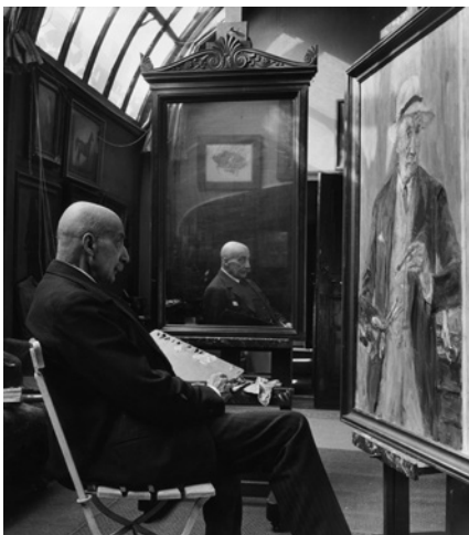
Figure 7. Max Liebermann with a Self-Portrait in his Pariser Platz Studio, Berlin, ca. 1930.