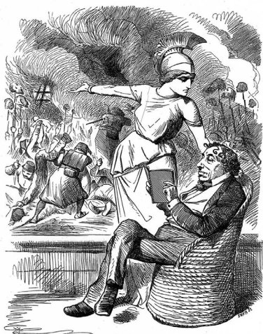
NEUTRALITY UNDER DIFFICULTIES.

Dizzy. "Bulgarian Atrocities! I can't find them in the 'Official Reports'!!!"