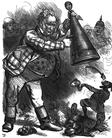
"BRAVO, JOHN!" THE ONLY RESPECTABLE WAY OF MENDING THE MATTER.