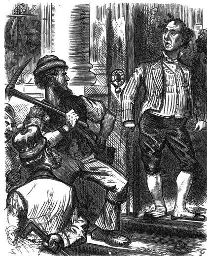
ENGLAND'S PRIDE AND GLORY.

Dizzy. "Bulgarian Atrocities! I can't find them in the 'Official Reports'!!!"