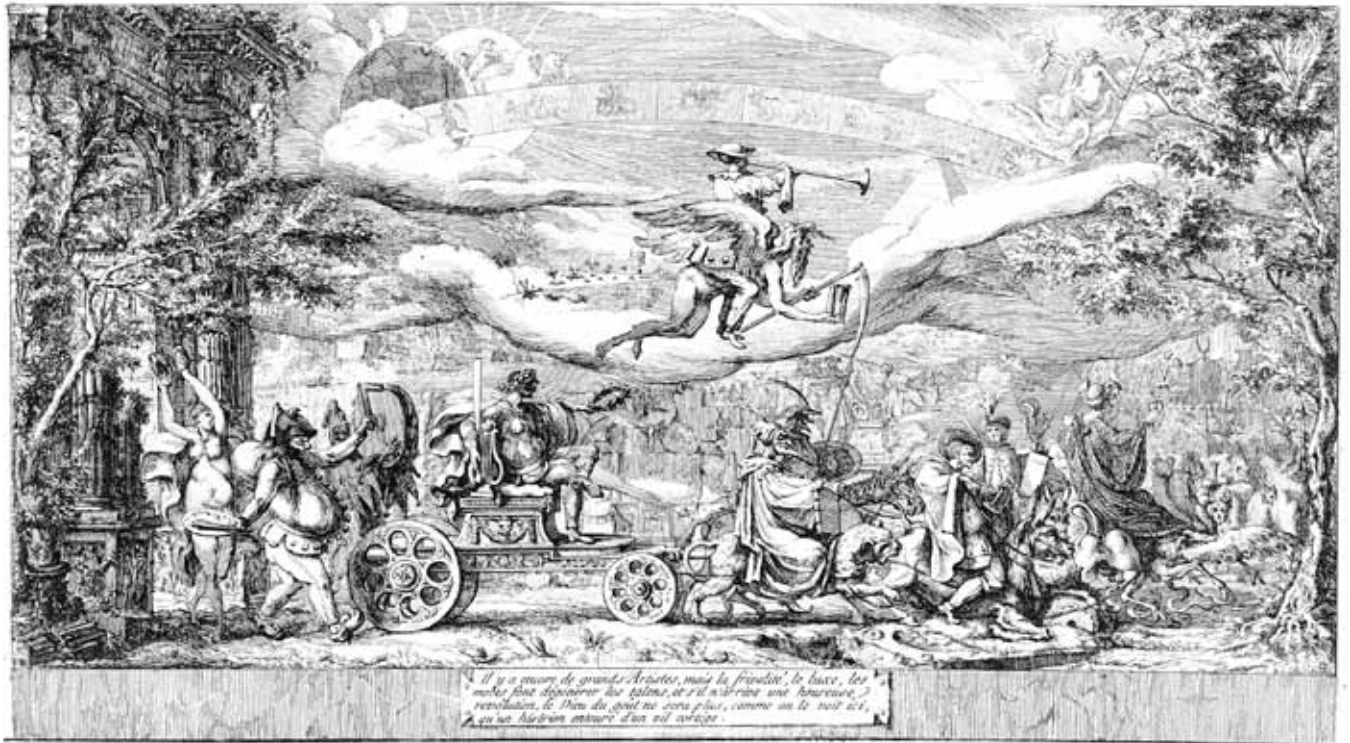
Figure 2. Anonymous, Triomphe des Arts Modernes , ca. 1760. Etching and engraving, 36.2 x 21.7 cm. BnF, Paris (Photo: Gallica, bibliothèque numérique, BnF).