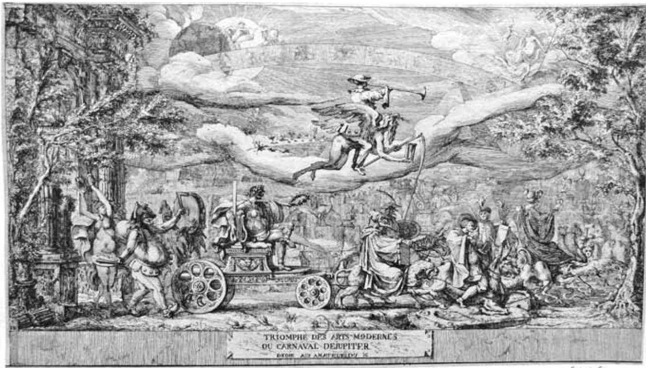
Figure 1. Anonymous, Triomphe des Arts Modernes , ca. 1700. Etching and engraving, 34.5 x 19.6 cm. Bibliothèque nationale de France (BnF), Paris.

it that tentatively date it to around 1700. A bit of digging reveals our anonymous annotator's dating motivations. On 16 May 1700, the librettist Antoine Houdar de la Motte staged a performance of his opéra-ballet , Le Triomphe des arts , and three years later, a comédie-ballet entitled Le Carnaval & la Folie was presented with Jupiter as the lead character. Both performances took up a strong modernist stance within the ongoing Quarrel of the Ancients and the Moderns that raged across France's national academies during this period; and both modernized the classic lyrical form and the heroic genre by weaving a set of mythological characters into carnivalesque festivities, emphasizing dance and galanterie throughout. Houdar's subversive cultural gesture is complemented by a political one: both plays argue for the independence of the arts from royal patronage and contradict Jean-Baptiste Lully's deferential court ballets from fifty years prior, in particular his Ballet des Arts (1663). 7