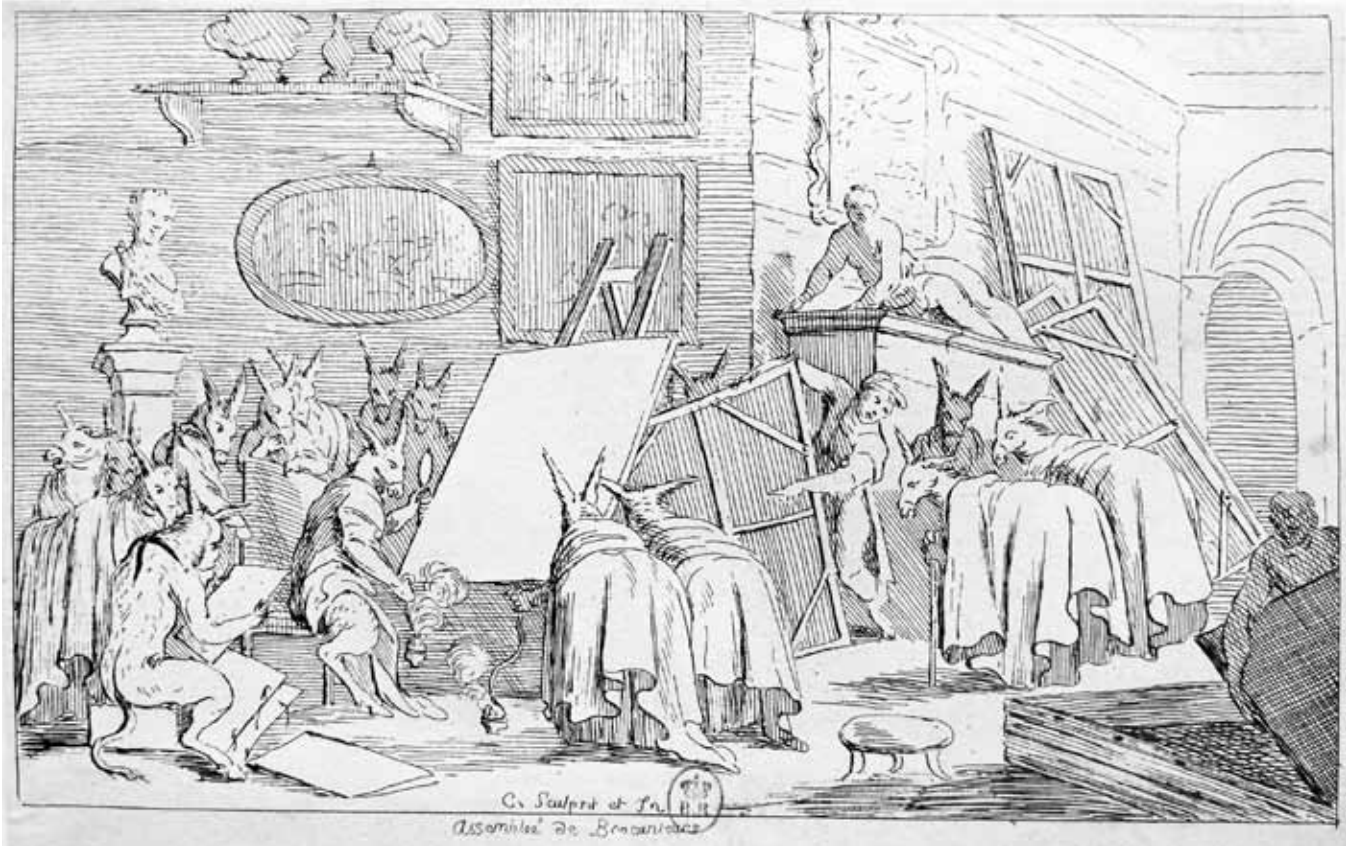
Figure 4. Attributed to the Comte de Caylus, Assemblée de Brocanteurs , ca. 1727. Etching and engraving, 22.2 x 14.6 cm. BnF, Paris (Photo: author).

the anachronistic style of each image in its restrike, in particular in Triomphe des Arts Modernes , where its use of procession, dense cluster of emblems, allegorical figures, and a key had become less popular by mid-century, and even less so in the Revolutionary period, when emblem and allegory were used sparingly and appeared alongside personal caricatures of distorted faces and bodies. 26