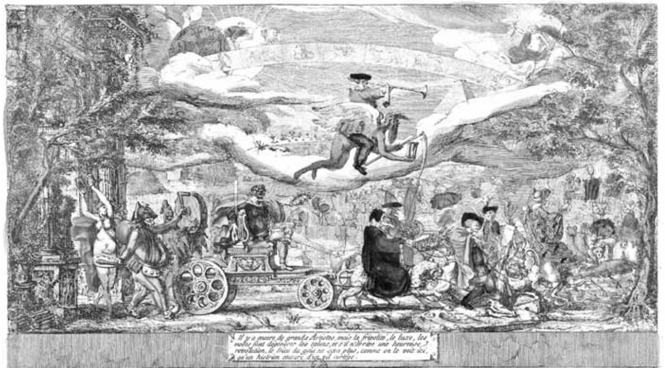
Les Arts sortant du Temple du Gout vont faire leur petition à l'Assemblée Nationale. Figure 3. Anonymous, Triomphe des Arts Modernes , ca. 1791. Hand-coloured etching and engraving, 37 x 22.5 cm. BnF, Paris.