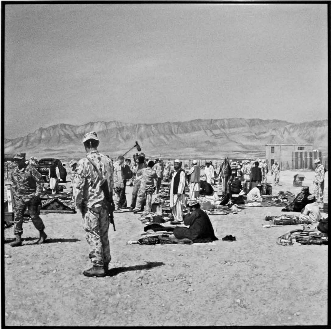
Figure 7. Lyndell Brown and Charles Green, History Painting: Market, Torin Kowt, Uruzgan Province, Afghanistan , 2008. Oil on linen. 121cm x 121cm. Collection of Lyndell Brown and Charles Green. Courtesy of the artists and the Australian War Memorial.