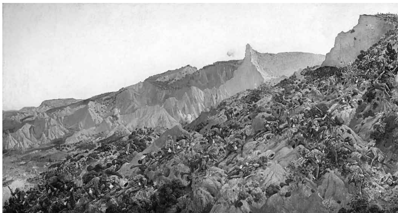
Figure 3. George W. Lambert, ANZAC, the Landing of 1915 , 1920–22. Oil on canvas, 200 x 370 cm. Australian War Memorial, Canberra, Australia. Collection of Australian War Memorial, ID number ART02873.

Choosing to work with Australia, he travelled to Turkey, where he familiarized himself with the landscape he painted in his celebratory work ANZAC, the Landing of 1915 (1922), which portrays the legendary battle of Gallipoli (fig. 3). This work has been on continual display at the AWM since it opened in 1922, and is considered “one of the most important paintings in the Memorial’s art collection.” 26 In another painting, A Sergeant of the Light Horse (1920), Lambert depicts not an idealized event, but a heroic type, a “digger” (Australian slang for soldier) in the Australian Light Horse, a WWI military cavalry regiment (fig. 4). 27 It is described in a 2007 Lambert retrospective as “a tribute to a type of Australian, generally a product of a rural background, who became part of the national mythology during the First World War: the Light Horseman.” 28 These works exemplify the kinds of cultural products that Bean encouraged, anchoring the history of the Australian war art tradition. 29