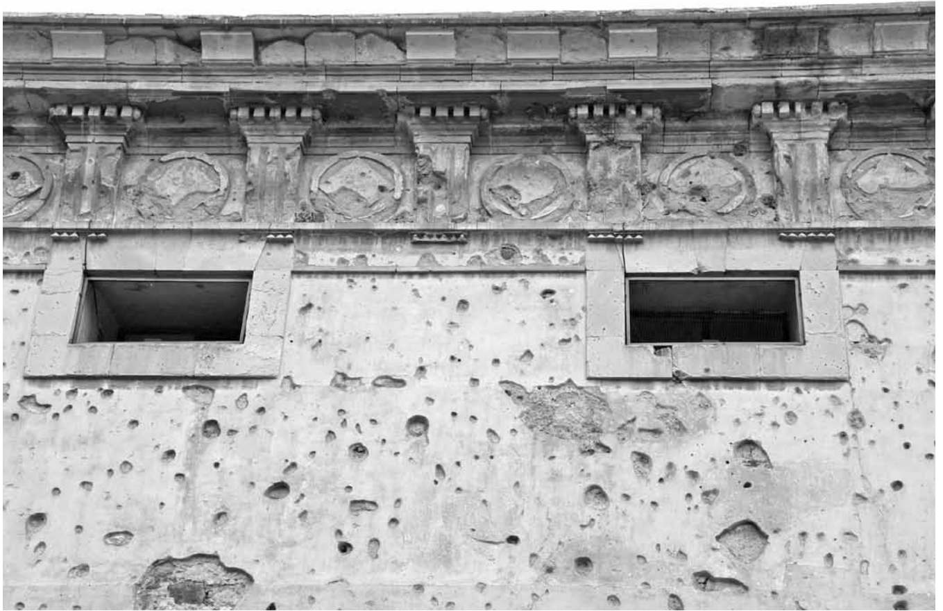
Figure 9. Granary of Granaditas, Guanajuato. Cornice with triglyphs and metopes crowning the façades.