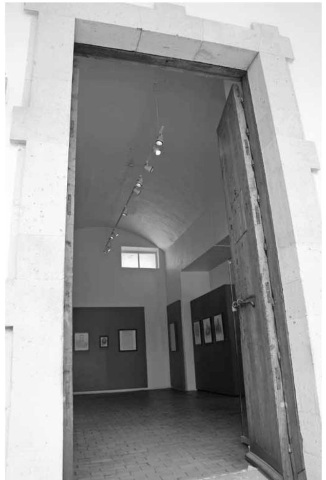
Figure 5. Granary of Granaditas, Guanajuato. Troje or storeroom Reproduction authorized by the Instituto Nacional de Antropología e Historia (Photo: author).

Mazo submitted his report on Guanajuato's new alhóndiga on 13 January 1797, “correcting” the “faults noted” in Durán's earlier report and attaching new plans and designs. 38 According