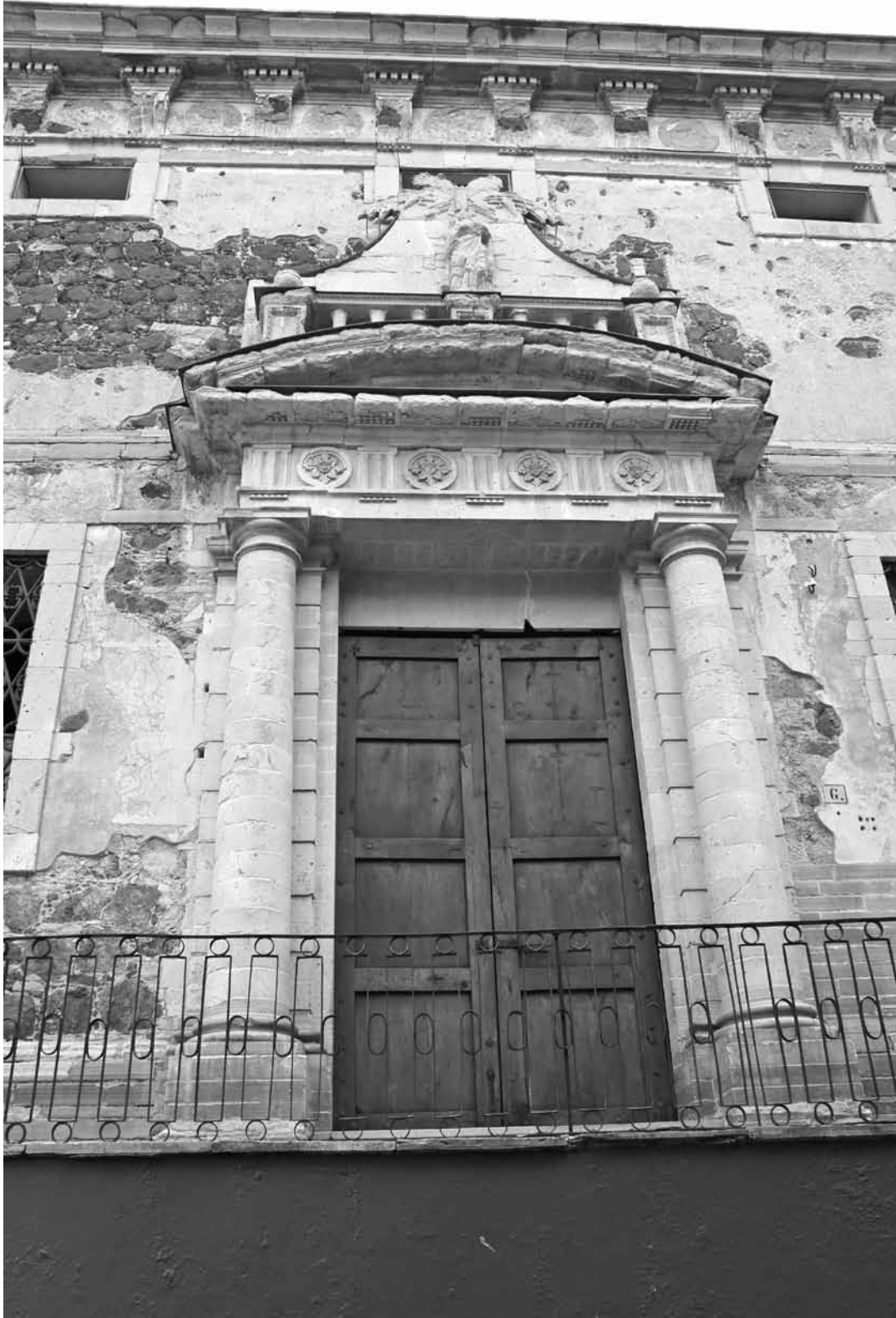
Figure 10. Granary of Granaditas, Guanajuato. East portal adorned with a sculptural relief.