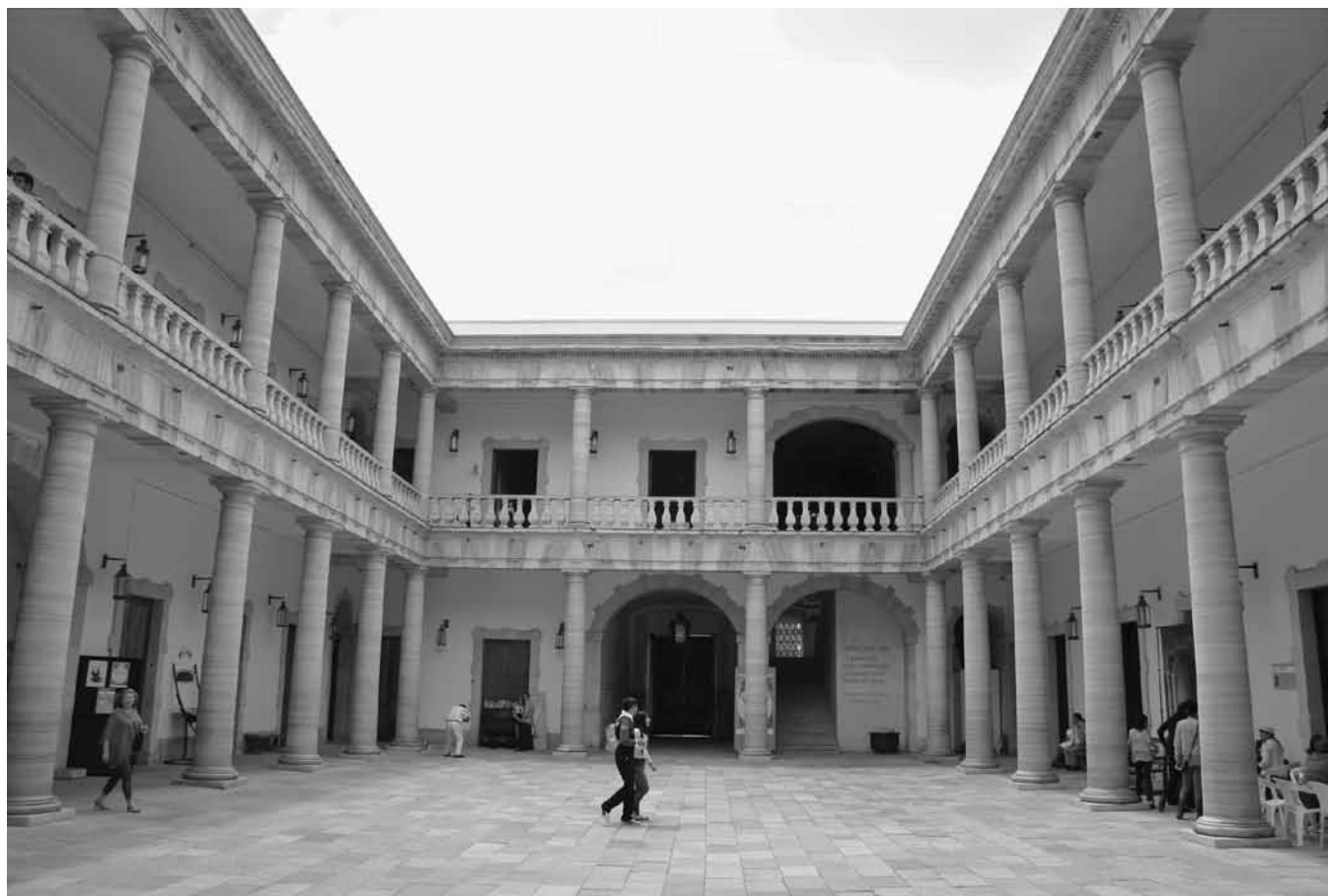
Figure 4. Granary of Granaditas, Guanajuato. Patio. Reproduction authorized by the Instituto Nacional de Antropología e Historia.

the use of hormigones (cement and aggregate) for the building, particularly for the construction of “vaults in the first and second floor.” 35 Good quality hewn stone would be used for the patio’s columns, entablatures, and lintels, the two main entrances of the building, the windows and doorframes, and the cornice crowning the four façades (fig. 6). Durán’s report also mentions the use of bricks and flagstones for paving, and provides additional detail regarding construction, such as the type of roof, the carpentry work for the doors and windows, the ironwork in the building, the tools and utensils needed, the cost of additional tasks such as the clearance of space and removal of old structures, and the salary of the master architect and his workers. The total budget amounted to 164,077 pesos and one real.