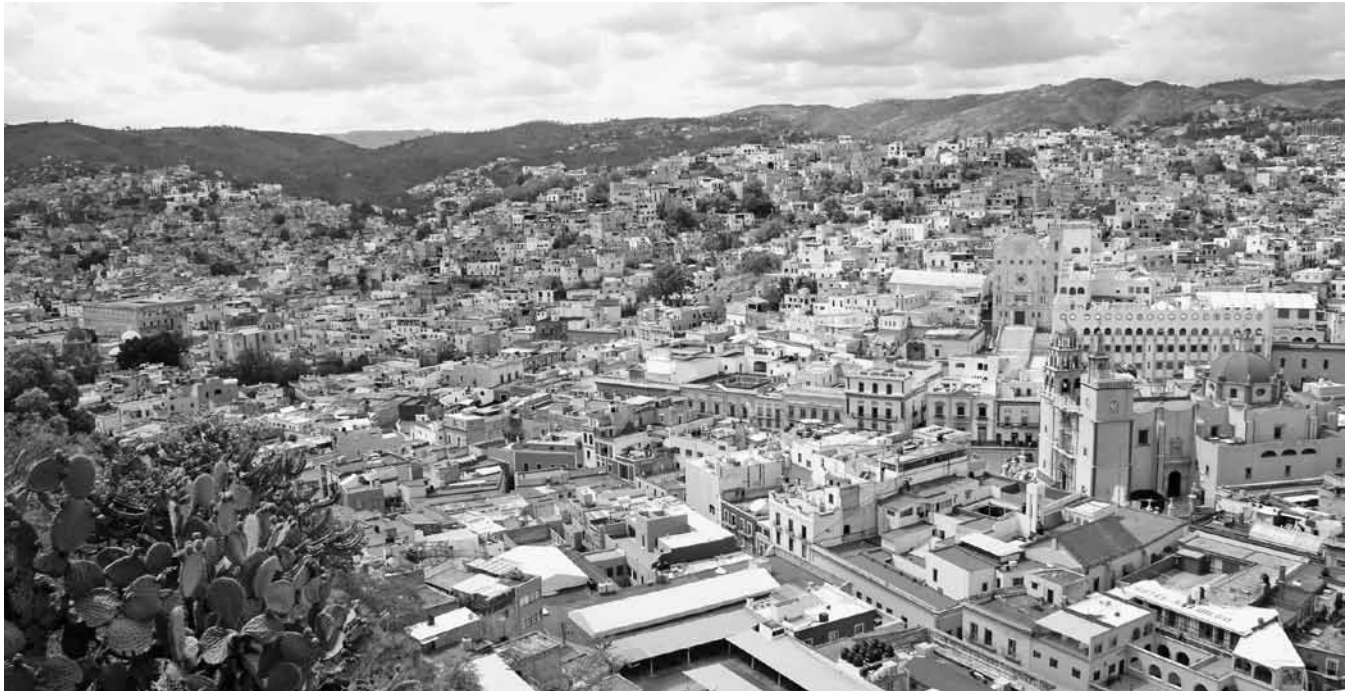
Figure 7. View of the granary of Granaditas (upper left) and the city of Guanajuato from the Hill of San Miguel.

“according to the plans and cross sections drawn by the Maestro Mayor de Arquitectura in this noble city, Mr. José del Mazo y Avilés,” and to finance the construction as requested. The project had to be announced, both in Guanajuato and in Mexico City, for the competition of potential architects. Since the new granary would be beneficial for the local mining industry, the chief finance committee also required the provincial council of mining to be informed and urged to collaborate in the funding. 42 The complete file, including the new designs, was sent to Riaño a few days later by Baltasar Ladrón de Guevara. 43 Though permission was granted, however, the licence was only issued a few months later, on 7 July.