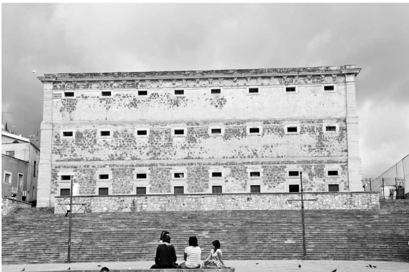
Figure 8. Granary of Granaditas, Guanajuato. West façade (Photo: author).

As soon as excavations began, Mazo and the city commissioners realized the previous budget would be vastly insufficient. Through various trial excavations, Mazo concluded that the land consisted of three types of stone: a “rock solid stone,” “ repetate [a soft-stone] composed of consistent and solid particles but friable in their union,” and a stone “halfway between these two extremes.” Mazo added the cost of the tools and powder needed for the excavations to the price of the houses and land site purchased. His new budget for the completion of the granary amounted to 53,000 pesos more than the one originally planned by Durán, and for which the viceregal licence had been granted. 47