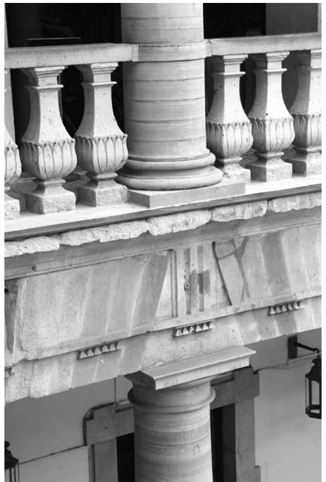
Figure 12. Granary of Granaditas, Guanajuato. Patio’s columns, entablatures, and balustrade. Reproduction authorized by the Instituto Nacional de Antropología e Historia (Photo: author).