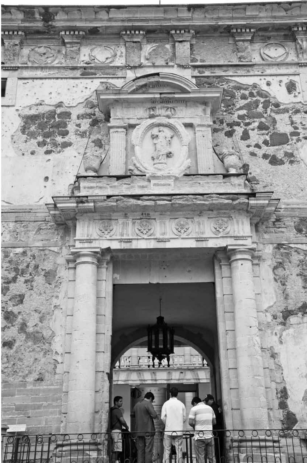
Figure II. Granary of Granaditas, Guanajuato. North portal adorned with a sculptural relief.