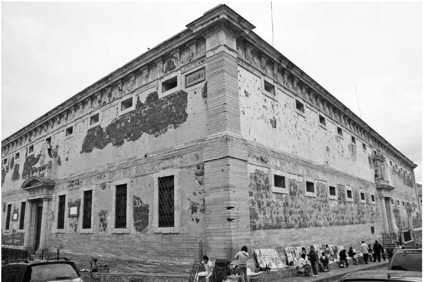
Figure 6. Granary of Granaditas, Guanajuato. East and north façades.

Nearly a month later, Mazo's report and new designs had not yet arrived in Guanajuato. This lack of response from the viceregal capital seems to have exasperated the municipal authorities, who, appealing to the viceroy's "condescension" and to his interest in the granaries and the common good, repeated their request for a licence to begin construction. Finally, on 14 March, the Junta Superior de Hacienda (chief finance committee) in Mexico City granted permission to build the alhóndiga