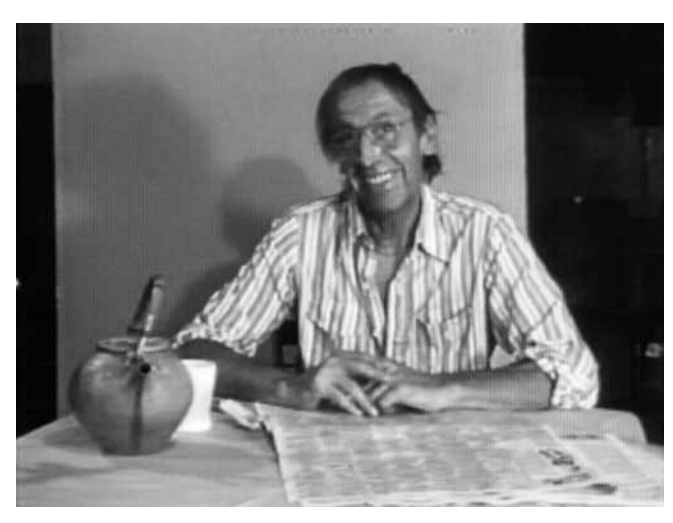
Figure 8 and 9. Stills from Robert Filliou, Breakfasting Together, If You Wish, 1979. Video.