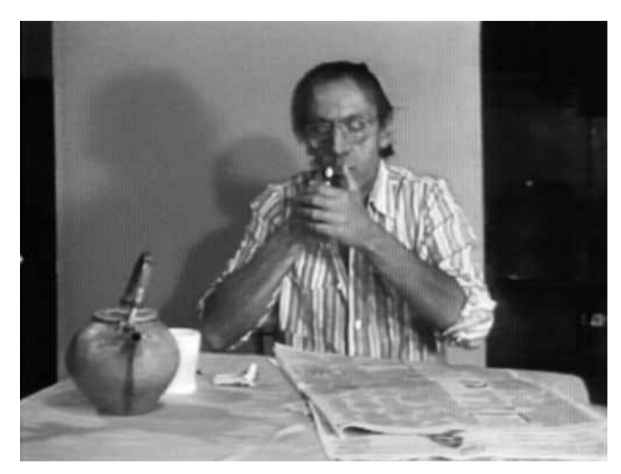
Figure 4 and 5. Stills from Robert Filliou, Breakfasting Together, If You Wish, 1979. Video.