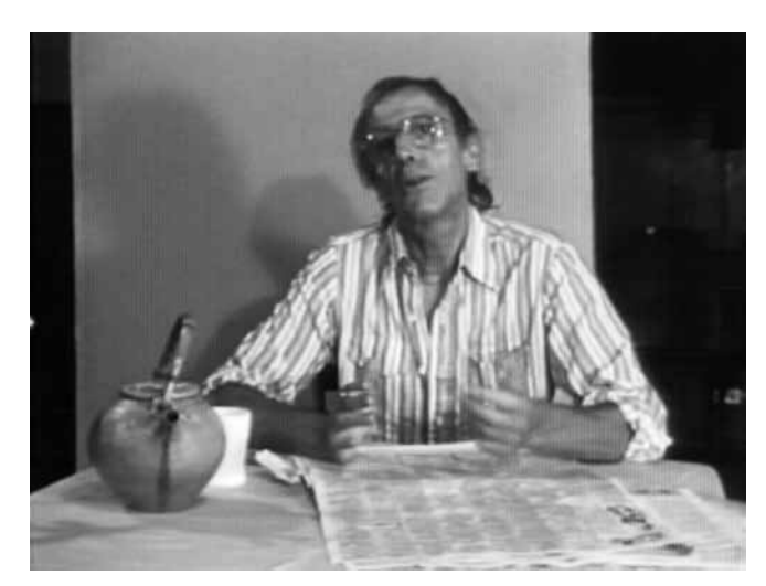
Figures 6 and 7. Stills from Robert Filliou, Breakfasting Together, If You Wish, 1979. Video.

I'm sure, but many parents, many adults looking back upon their childhood or their youth—they feel that along with a formal education came a lot of, uh, of brainwashing ( laughs ) or, learning that they have to unlearn. ( reflects )