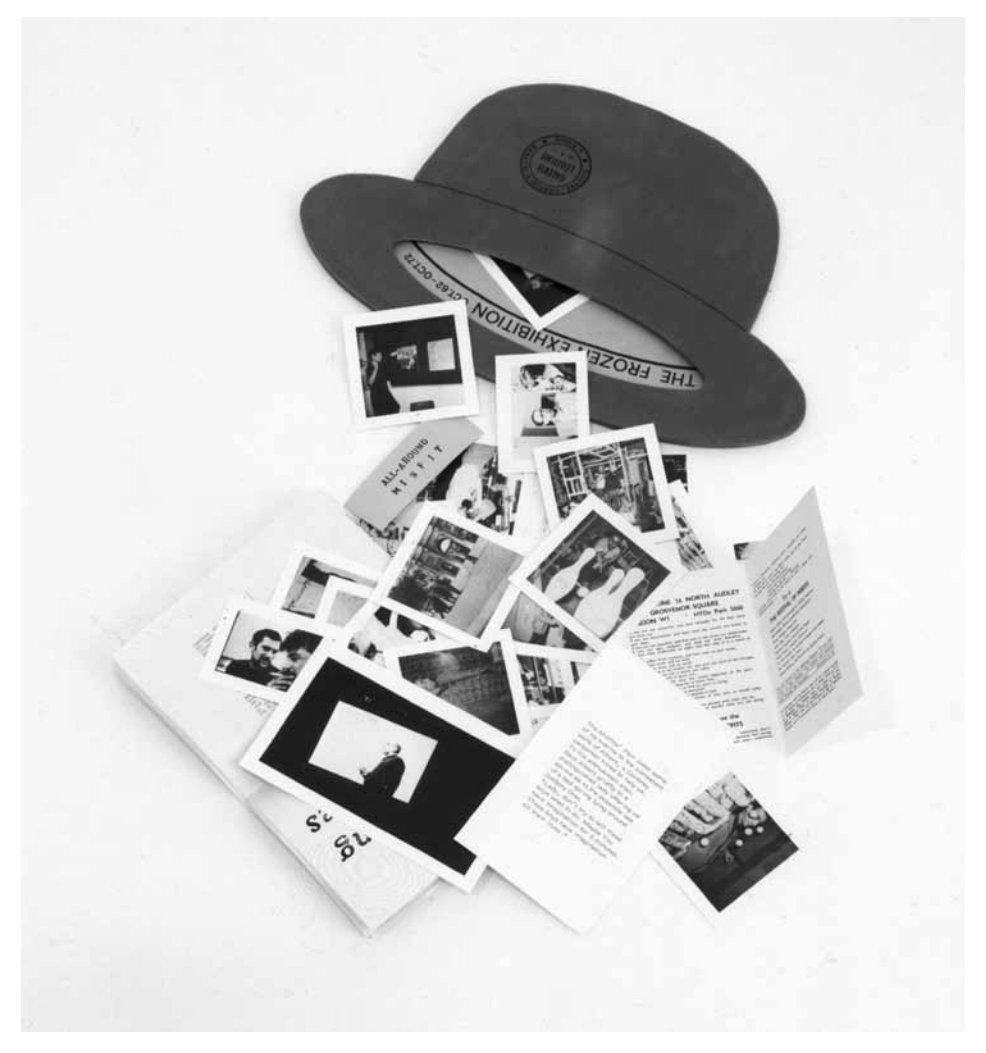
Figure 1. Robert Filliou, Galerie Légitime. The Frozen Exhibition , 1972. Cardboard bowler hat, photos, and text, 31.6 x 20 cm.

and poetical economy. In order to do so, I will situate the work in the economic context in which it was produced, a moment in the history of neoliberal capitalism that has led to the present conditions of risk and austerity that mark the working lives of the vast majority of artists and intellectuals within post-Fordist social regimes. I conclude the essay with Lefebvre's view that irony can act as a means of protesting alienation. Lefebvre's definitions of the ironist allow me to consider the ways in which Filliou's humour sought to offer a critique of capitalism while not reducing the possibilities of the poetic to the demands of the political. With this form of humour, we could say, Filliou's Breakfasting Together explores alternatives to the stultifying socioeconomic conditions that confronted artists.