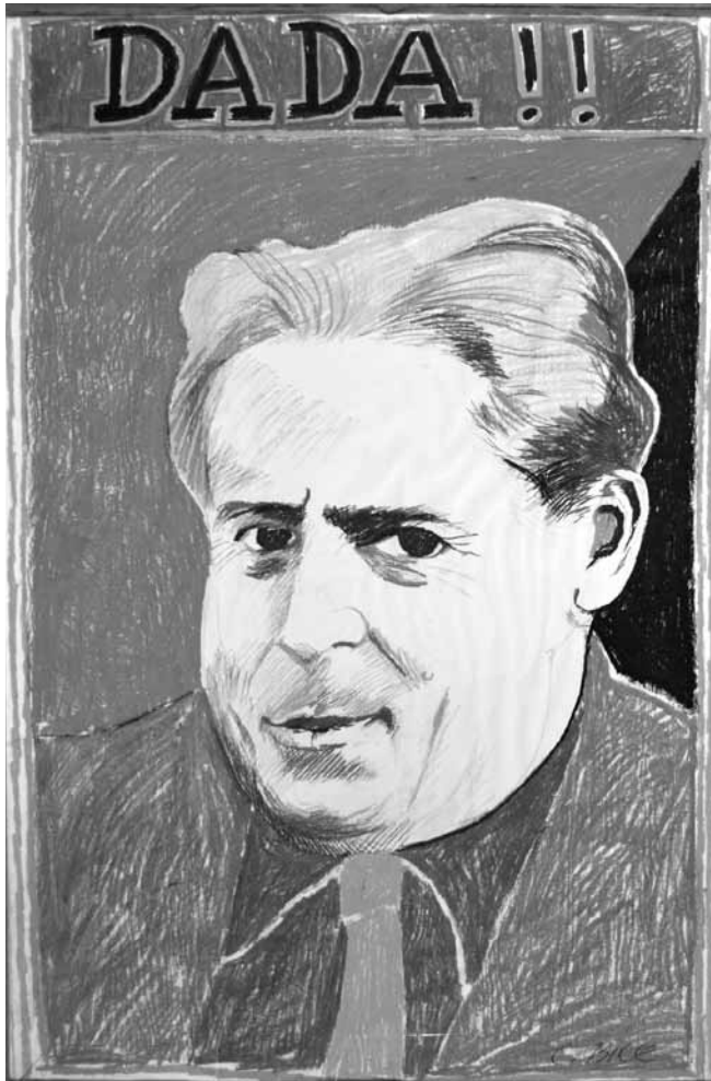
Figure 3. Greg Curnoe, DADA!! Late 1964. Oil pastel on newsprint, 134.6 x 89.3 cm. London, Ontario, Collection of McIntosh Gallery, The University of Western Ontario. Gift of Sheila Curnoe, 2009 (Photo: © Estate of Greg Curnoe / SODRAC (2011)).