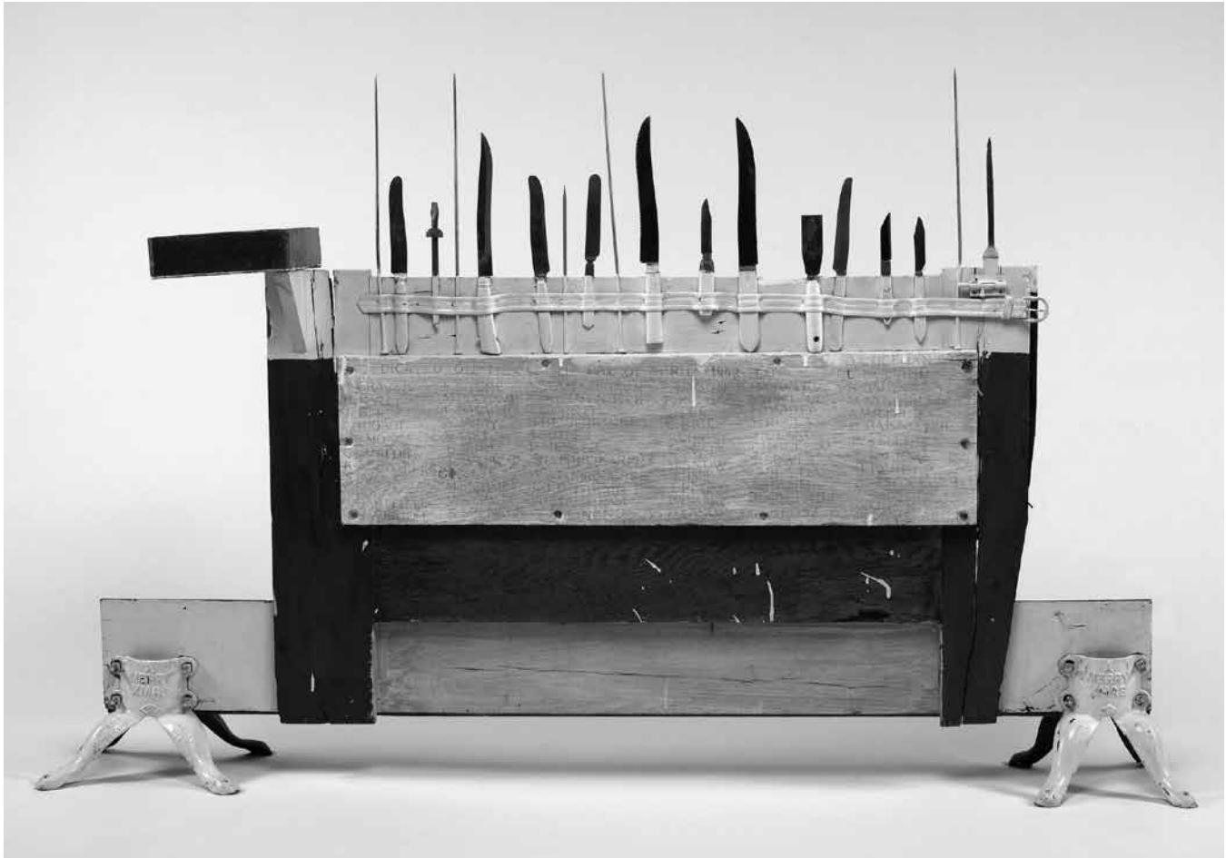
Figure 1. Greg Curnoe, Hurdle for Art Lovers , 9 April 1962. Assemblage of wood, cast iron, plastic belt, oil-based paint, ink, silver knives, stainless-steel knives with wooden and plastic handles, aluminum knitting needles, bamboo stick, silver spoons, steel screwdriver blade, and mastic knife, 99 x 158.5 x 26.5 cm. Ottawa, National Gallery of Canada. © Estate of Greg Curnoe / SODRAC (2011). (Photo © National Gallery of Canada).

One of Curnoe's early Neo-Dada works, Hurdle for Art Lovers (1962; fig. 1), was conceived with this type of strategy in mind. The menacing-looking construction was made out of various knives and other utensils, knitting needles, sharp sticks, and a mastic knife. These sharp and pointy objects were mounted on scraps of wood and supported by Christmas tree stands, and they threatened to castrate those brave enough (or foolhardy enough) to jump over it. Ron Martin remembers seeing fellow artist Brian Dibb repeatedly jumping over the hurdle in Curnoe's Richmond Street studio, an act that Martin likened to playing Russian roulette. 28 Although Curnoe's work often bordered on the ridiculous, there was nevertheless an underlying seriousness to much of it. Despite its humorous aspect, Hurdle for Art Lovers , with its witty title, was a sharp and satirical com-