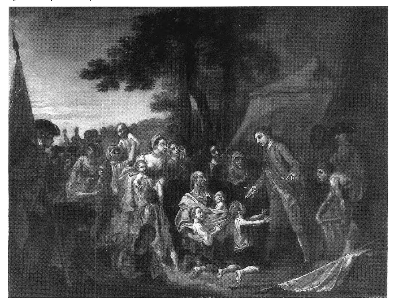
Figure 2. Francis Hayman, The Humanity of General Amherst, 1760, oil on canvas, 70 x 91.4 cm. The Beaverbrook Foundation, the Beaverbrook Art Gallery, Fredericton, New Brunswick.

would see the light. He characterized the canadiens as "vigilant," "laborious," "obedient," "stout, comely and intrepid,"<sup>33</sup> people who had simply been misguided and forced into Catholicism by the evil popish church. Once they had been in contact with the British monarch, he contended, they would soon become aware of "what our protestantism inspires . . . [in the] exercise of social virtues" and would quickly convert.<sup>34</sup>