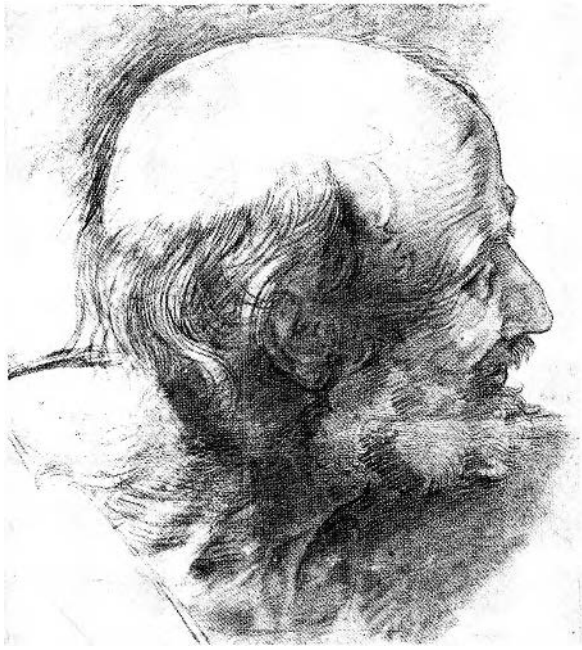
FIGURE 5. Raphael. Head of an apostle. London, British Museum.

that the drawing was taken to the scaffold to serve as a sort of auxiliary cartoon during the transfer process – the careful modelling and the exact reproduction of details suggest this. Naturally it is also possible that the drawing was produced from the beginning as an auxiliary cartoon (in accordance with Fischel); that means it was traced from an original cartoon of the same scale and then reproduced exactly. It should not disturb us that the outlines here were traced in a perforated manner – and not as in Raphael's auxiliary cartoons by a bag of charcoal; this is actually only a question of the production of the drawing, and not a question of its function. 22 If this second possibility were proven correct, it would mean that Ghirlandaio used auxiliary cartoons before Raphael did. These reflections may seem hair-splitting, but considering that Ghirlandaio was an organizer par excellence, he could easily be credited with such an innovation of the work process.