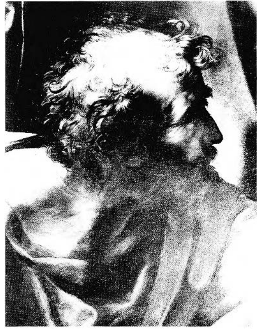
FIGURE 6. Raphael, Head of an apostle, detail from the Transfiguration . Vatican.