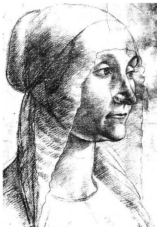
FIGURE 3. Ghirlandaio, Head of a lady , drawing. Chatsworth.