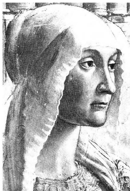
FIGURE 4. Ghirlandaio, Head of a lady , detail from the Birth of Maria . Florence, Sta. Maria Novella.